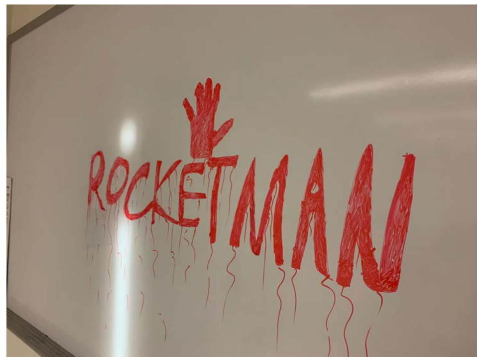
Bloodstained Whiteboard Reading ROCKETMAN