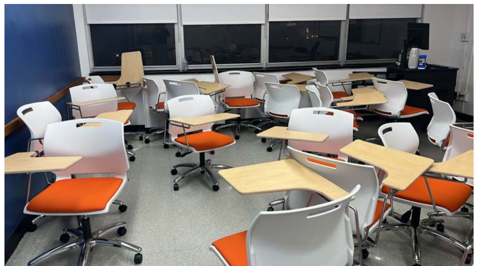
I simply can't.

My laptop screen, Falls gracefully down. Into my lap, In the coffee it drowns.