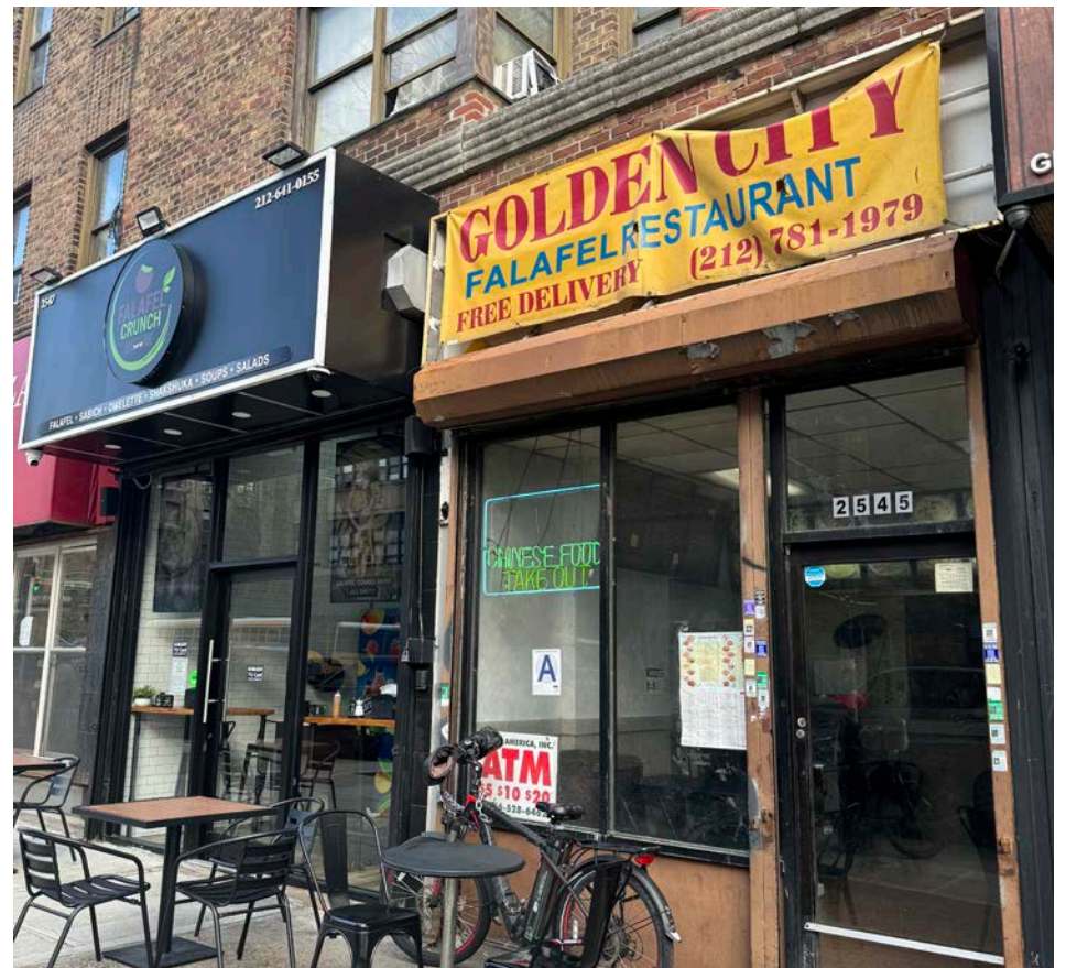
The new Golden City Falafel Restaurant on Amsterdam Avenue next to its competition.

Golden City declined to comment about the rebranding.