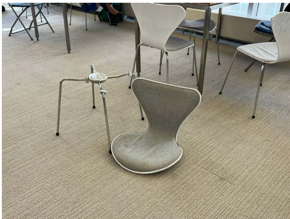
A disassembled chair

In the administration's latest attempt to hinder Gemara learning at Stern, they sabotage all the chairs in the beit midrash.