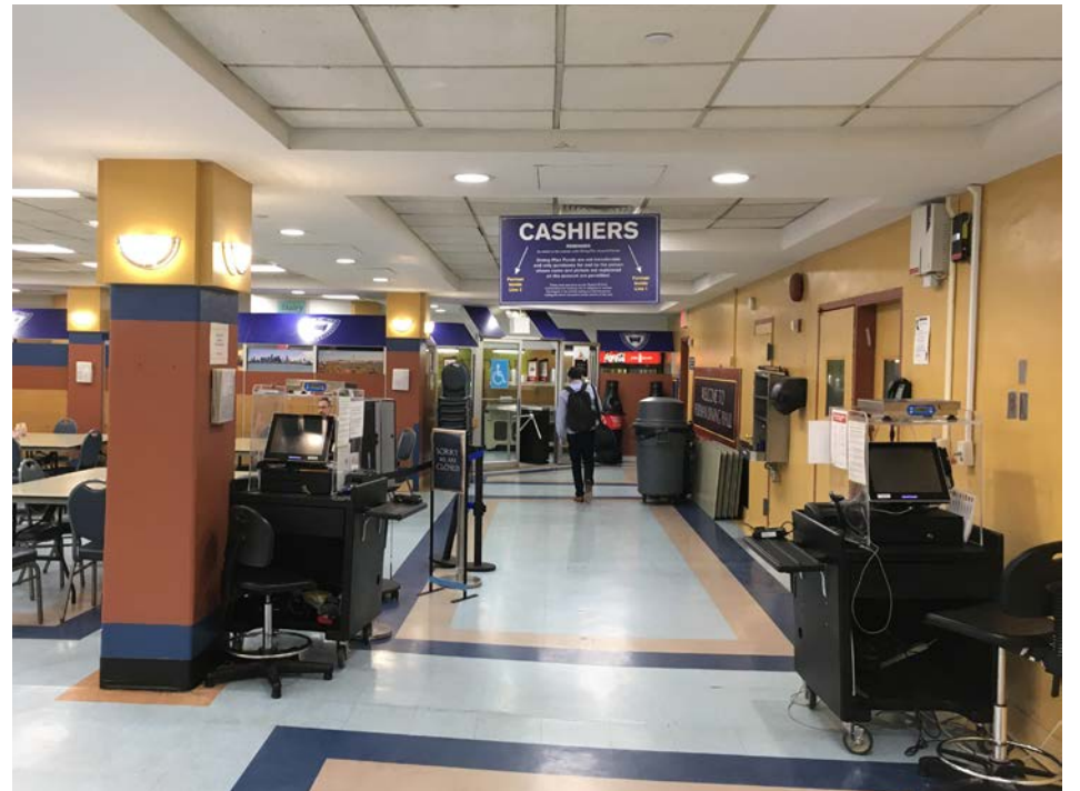
The Wilf Dining hall in its modern design