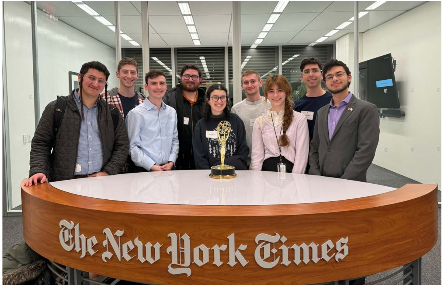
The Commentator staff on an actual trip to The New York Times.