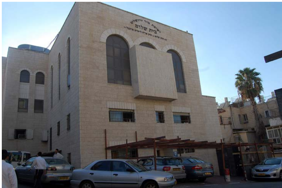
Mir Yeshiva for Women

However, hope is not lost for future Talmidot Chachamot. The email announcing the cancellation of Talmud classes included a caveat, such that classes may be reinstated pending an improvement in the Stern students’ middot.