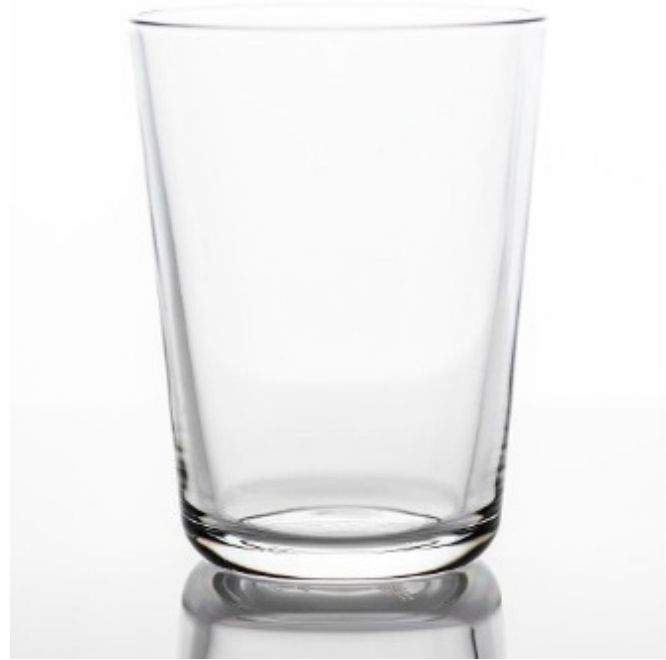
A cup made from the revolutionary new transparent metal.

As we go to print, the Math department has just unveiled a counterexample to the Golbach Conjecture, setting off a new riot among philosophy majors.