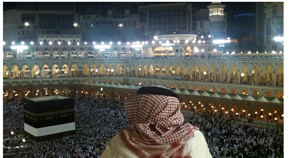
The author in Mecca

on the trip due to a relative being a member of the administration. “It was so wonderful, and being trapped near so many men in a hot crowded square made me appreciate the deodorant brands we so take for granted in America.”