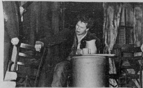
Marat/Sade Queen and the Rebels Ten Little Indians Stalag 17