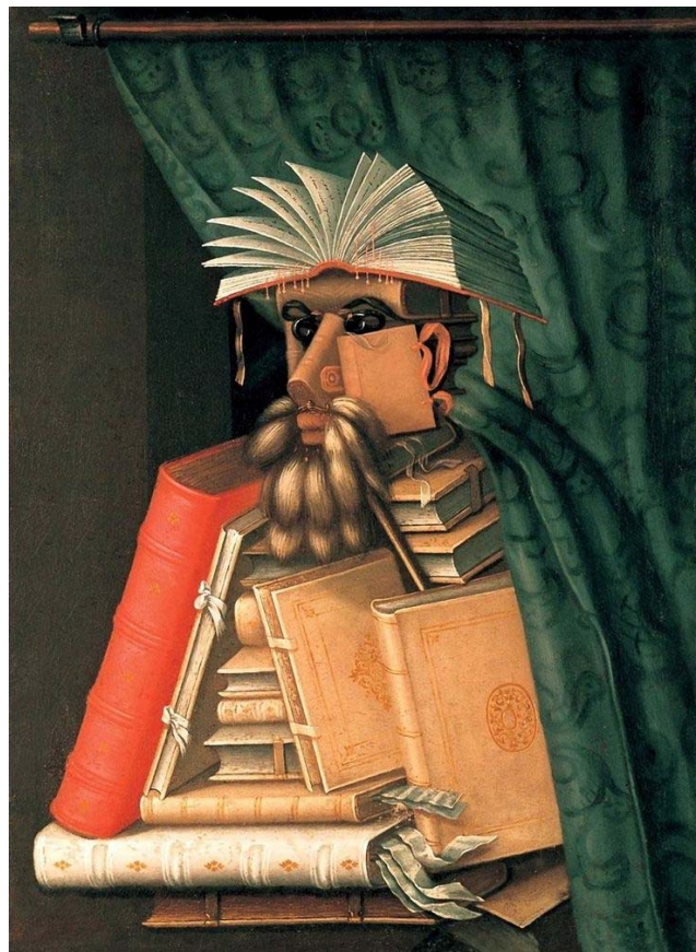
The Librarian (ca. 1566) by Giuseppe Arcimboldo