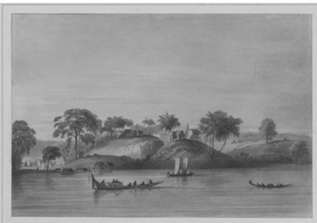
Vue de la Savane des Juifs sur la rivière de Surinam.

Caribbean colonies and who now found themselves beginning a new chapter as plantation owners in the Tropics.