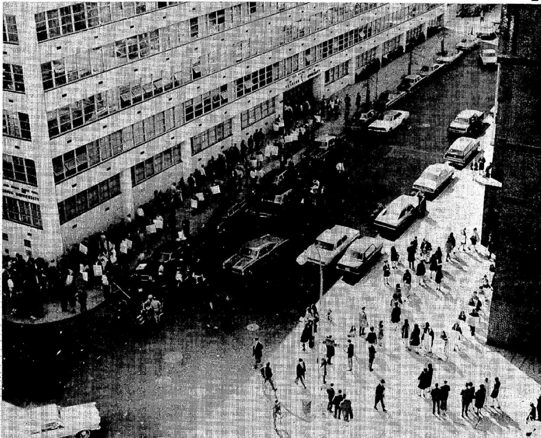
Students picket in front of Furst Hall on Sunday, April 12, in response to the alleged "secularization" of the University. Rabbi Joseph Soloveitchik, addressing the Chag Hasemicha, reacted to the picket by speaking out on his fear of "secularization" and expressed the possibility that if present policies continue he might be forced to resign.