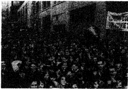
Students march from Soviet Mission to the United Nations in protest over conditions of Jews in Russia.