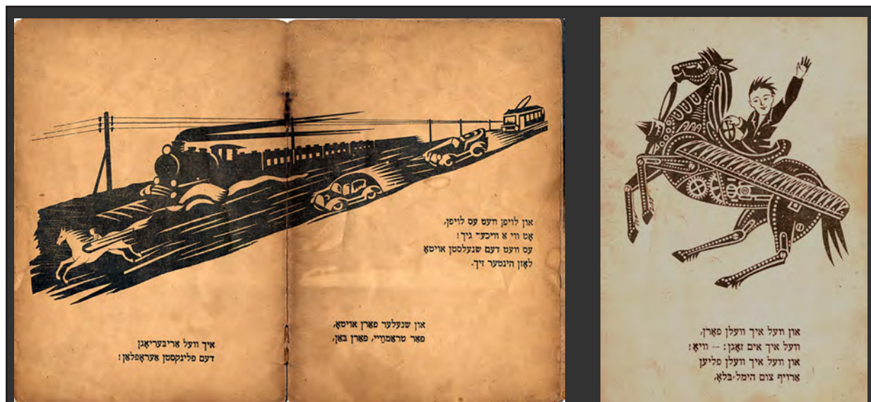
Figure 8. Ber Sarin, Ven ikh vel zayn a groyser (When I grow up; Wilno: U. Margolis i S. Klaczko. Lit. N. Mac i Syn, 1937), p. 4–5 (left), p. 2 (right)

in a shtetl; this shtetl does not appear to be a completely safe environment, since Feter shpeter's home is ransacked (see Figure 5 ).