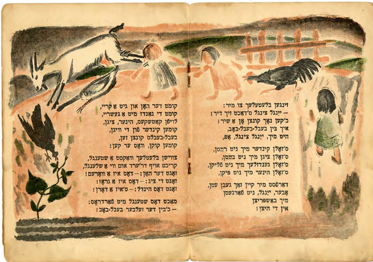
Figure 4. Ber Sarin, Bebl bebl bob (Beanie, beanie, bud; Wilno: Farlag far kindes [Ber Sarin], Mac i syn, 1938), p. 4–5