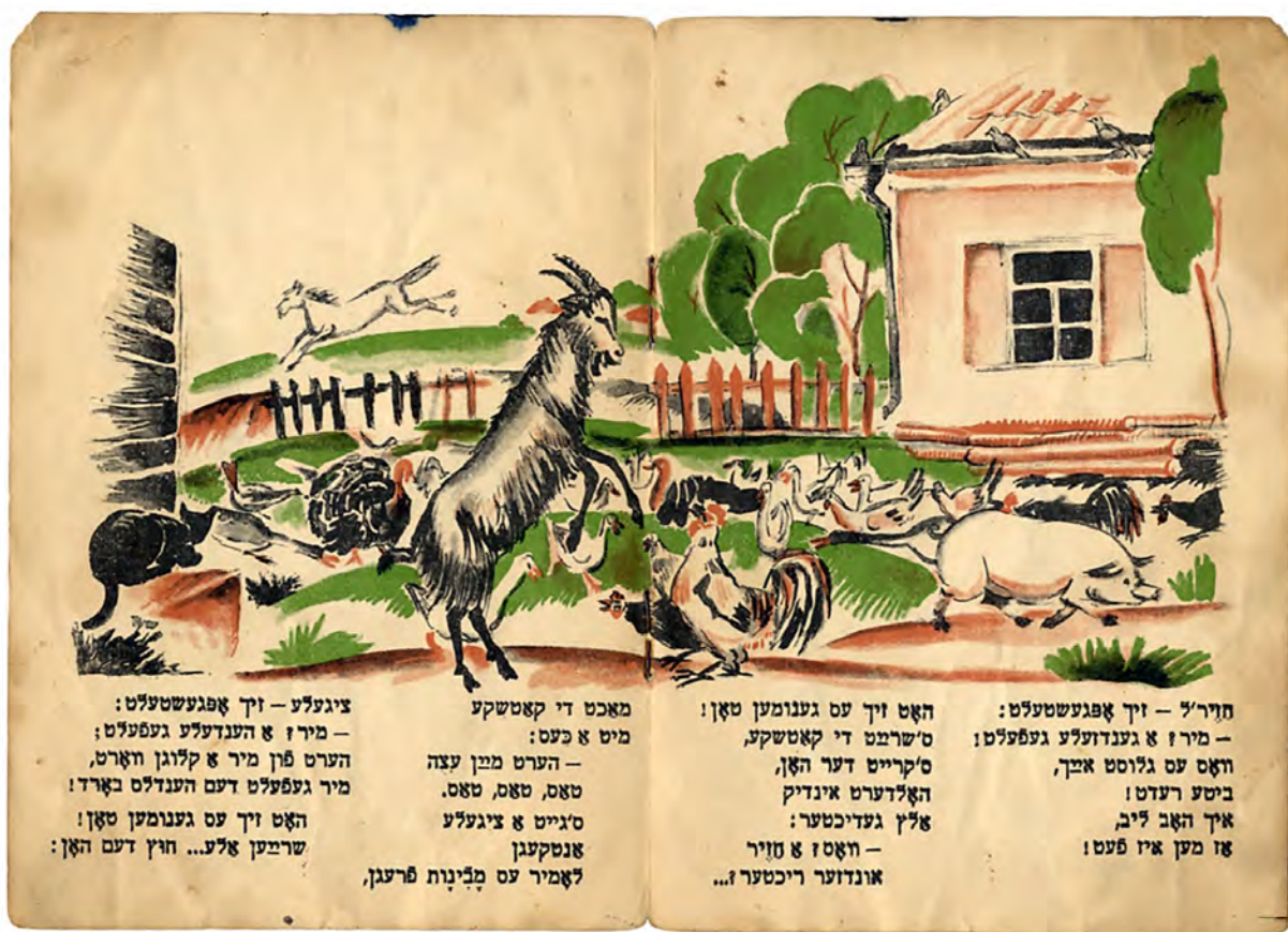
Figure 7. Moyshe Levin, A křigeray (Barnyard brouhaha; Wilno, Farlag far křinder [Ber Sarin], Mac i syn, 1938), p. 4–5

Levin’s story Yen ikh yel zayn a groyser celebrates curiosity, adventure, and hope. It embodies a universalist spirit and is a prime example of Levin’s work. As is typical of his writing, Levin’s stories for young children are set in the world at large, rather than a specifically Jewish world (see Figure 8). For example, some of the farm stories mention or include illustrations of pigs, an animal which would not be found on a typical Jewish farm (Figure 7). Feter shpeter is one of the only stories with a specifically Jewish setting; it is clearly stated that the action takes place