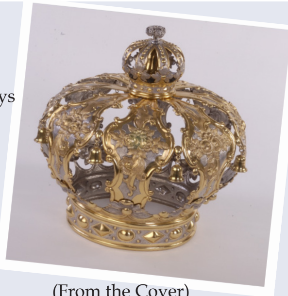
Left: Torah Crown Austro-Hungary, ca. 1886-1922 Silver: repoussé, chased and parcel gilt Collection of Yeshiva University Museum Gift of the Jewish Cultural Reconstruction