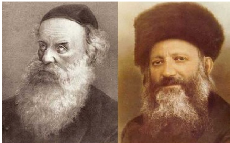
From left, Rabbi Shneur Zalman of Liadi (the Ba'al ha-Tanya), and Rabbi Abraham Isaac Kook.

Radically different forms of worship emerge from the proponents of Jewish philosophy and Jewish mysticism, respectively.