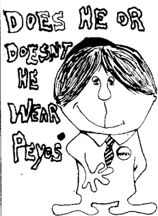
Only his rebbe knows for sure