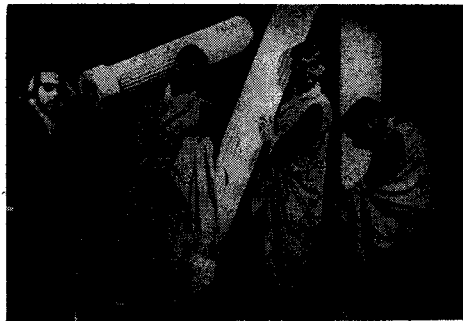
So they're moving us uptown after all.