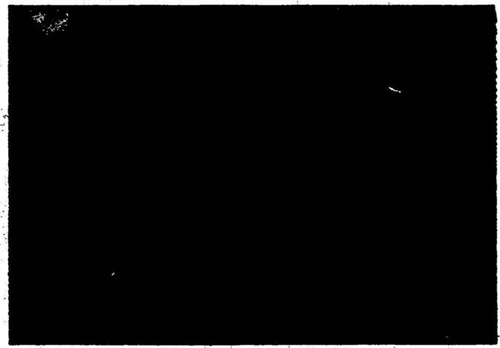
REFUGEE CHILDREN — What are we going to do with them?

When this black age of unbelievable torture and suffering shall pass and the voice of freedom shall ring throughout the world and when the shackles of hate and despair shall forever be broken, our people shall come forth proudly and staunchly. Higher and higher shall we rise above the shoulders of man. Slowly but surely shall we march along the glorious road that leads to our everlasting homeland. Lo and behold the gates shall open. Israel shall forever be—a people!