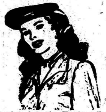
Leader of Agudath Hamisnagdim

The question of Palestine was brought up from the floor, but the chair ruled a discussion on the matter out of order. He explained that the constitution of the organization did not recognize that such a place existed, and therefore the individual members might take a hint and support Zionism only where the temper of their community warranted it.