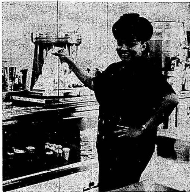
Miss Bananas of Home Economics Department displays her wares.