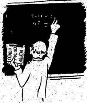
Noted cryptologist at work.

In commenting on the change, the FDSISS administration pointed out the proud history of the Yeshiva since its founding in the 19th century and remarked how proud the founders would be today on hearing the exciting news.