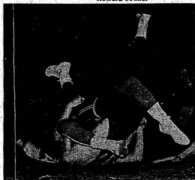
Epstein serves up level-ly set leading to smashing victory.

elated when the teams tallied points. The Wittenbergs scored on a 3 point play, and a fine reversal. The Taubermen relied on their fine touch.