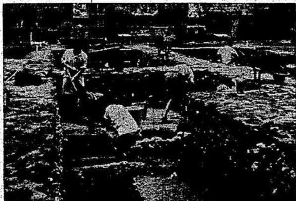
College Work-Study participants avail themselves of golden opportunity to frolic in the summer sun. Notice the modern equipment.

Sign Up For Summer College Work-Study On The New Library