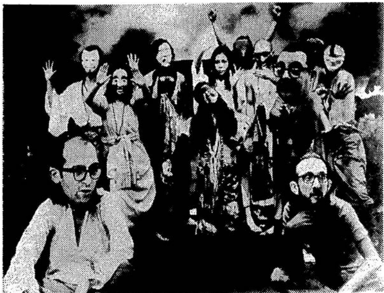
The Yeshiva clans gather to celebrate their union.