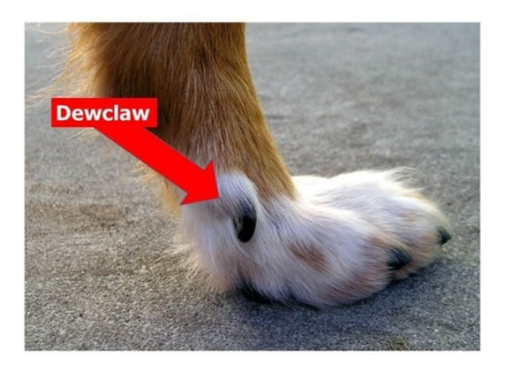
Figure 3. Dewclaw of a wolf

The clawing of a wolf, at the most, involves two dewclaws, whose purpose is not to maul the prey, but rather to hold and stabilize it. The amount of decaying flesh within a wolf's dewclaw probably is limited, perhaps, sufficient only to be fatal to a small, but not to a big, animal. Conversely, the main function of a lion's sharp, ultra-strong claws is to grab the prey and dig into its flesh. The claws are meant to grip and hold the prey, piercing through skin and muscle for a tight hold. A lion has five claws on the front and four in the back - the extra front claw (dewclaw) grasps prey from a different angle from the others claws, helping the lion hold on strongly. If these 8-10 claws are heavily contaminated with decaying flesh from a prior kill, it is understandable that such clawing would be fatal to large animals. Difficulty three, answered.