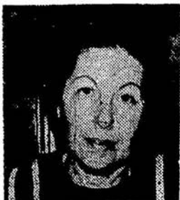
The Countess —

"I knew dere was something wrong, but I couldn't put my tum on it."