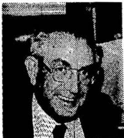
The Pilot —

Was she the power behind the throne or just a front?