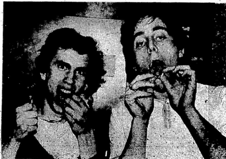
It takes two hands to handle a Bonsai.