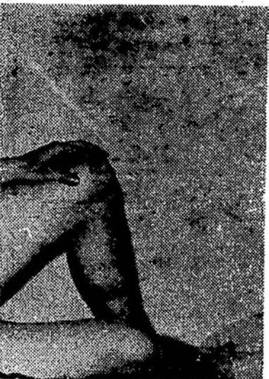
... affected by cuts

A YCSC AUDIO-VISUAL COMMITTEE PRESENTATION CONTINUOUS SHOWINGS — THREE HOURS WEEKLY