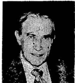
Ze Hungarian Refugee —