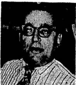
The Head of Security —

"I knew dere was something wrong, but I couldn't put my tum on it."