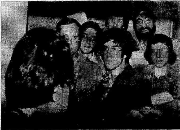
An exciting scene from last year's Olympics, in which competitors tried, but failed, to TL the registrar's secretaries. The pre-laws this year, however, had much more success, in their unsuccessful try to out-Grubb the pre-meds.

Although badly beaten in the first event, the Hotshots were ready for the next event, the Stab-in-the-Back competition. The pre-laws have traditionally done well in this event, and this year proved no exception. The Hotshots led off with evidence that they are collectively holding 425 spots in 16 top law schools, and appeared to have the medal clinched when they produced copies of seventeen withdrawal letters they had sent out for members of their own class reading, "I am deceased. Please withdraw my acceptance to your school and forward by deposit to the Pre-law Society of YU."