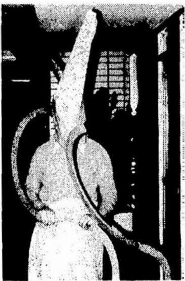
Beldar Conehead, minutes after crashing into Furst Hall.

picture of Beldar Conehead as he appeared standing beside his