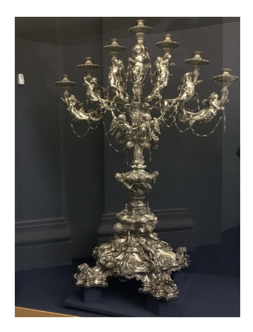
Fig. 6. Steven Fine, "The Seventeenth Century and the Baroque World," La menora exhibition, 2017, Vatican, Photograph.

labras from the cathedral in Mallorca, and Poussin's 1638 version of The Destruction of the Temple in Jerusalem (in Vienna). A wide selection of Jewish liturgical artifacts that referenced the menorah, mainly Italian, followed in "The Menorah in Jewish Decorative Art and Ceremonial Ornaments: From the Ghetto Period to Emancipation" (fig. 7). The path continued to "The Nineteenth Century," which highlighted the Visigoth sack of Rome. This was splendidly represented in a painting by Karl Pavlovich Bryullov's Sack of Rome by Genseric in 455 (1833-1835), now in St. Petersburg (fig. 8). Perhaps most fascinating was a large stone discovered in the garden of the Great Synagogue of Rome in 1994. This nineteenth-century fake relates that three brothers executed under Emperor Honorius "found the relics of Jerusalem, the candelabrum and the Ark, in the Tiber," and like a treasure map tells how to find them. This hoax was clearly part of an attempt to support plans to dredge the Tiber in search of the lampstand during the nineteenth century. The notion that the menorah was dumped in the Tiber was then