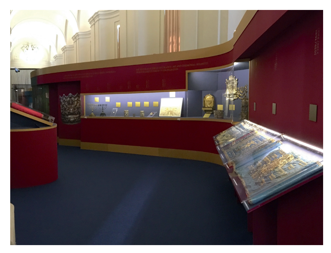
Fig. 7. Steven Fine, "From the Ghetto Period to Emancipation," La menora exhibition, 2017, Vatican, Photograph.