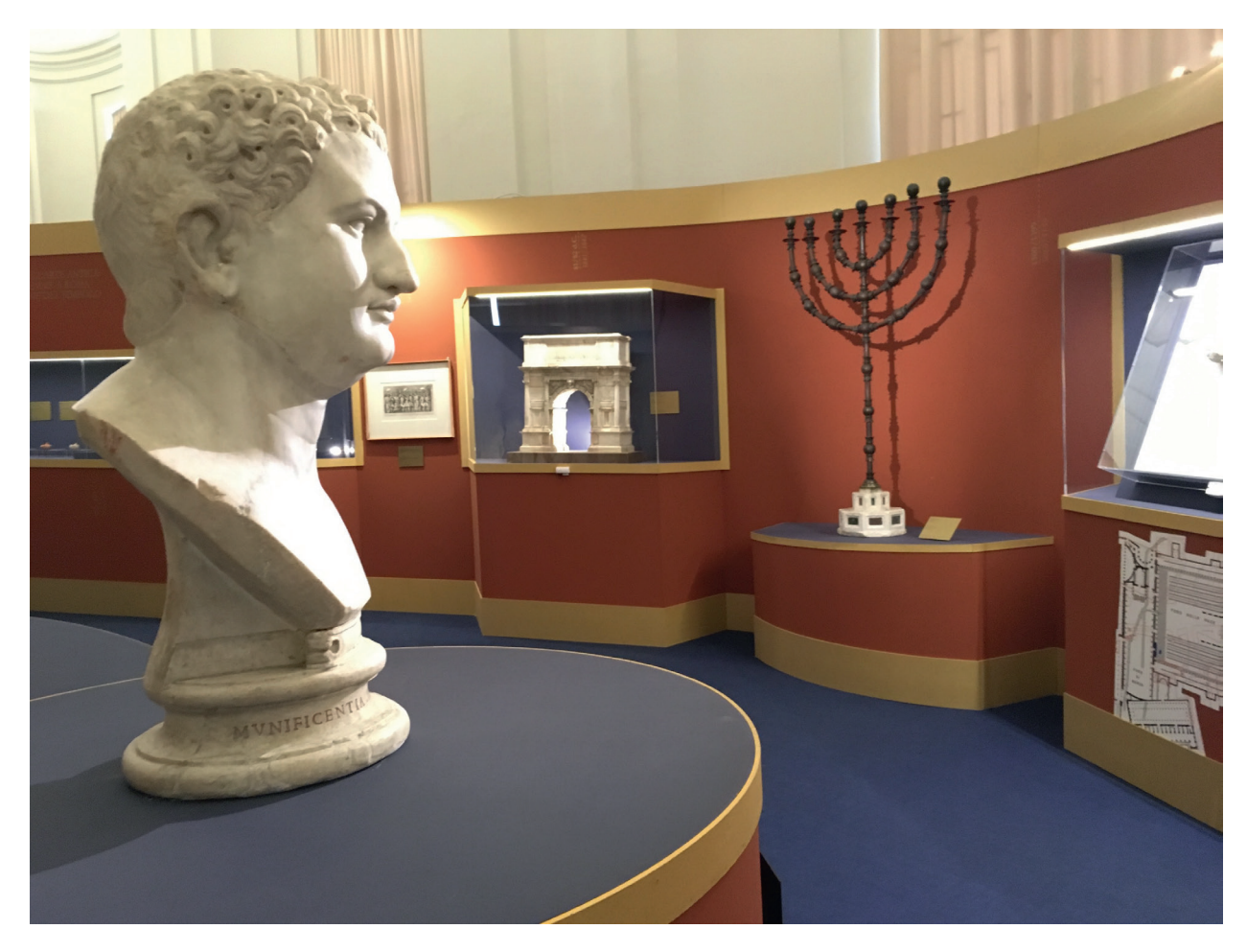
Fig. 4. Steven Fine, "The Menorah in Ancient Art: From Jerusalem to Rome," La menora exhibition, 2017, Vatican, Photograph.

(ca. seventh century) and a large Christian candelabrum from the cathedral in Padderhorn (ca. 1300). This hall contained both Christian and Jewish manuscript images of the biblical lampstand, which were placed side by side, visually asserting continuity between the Jewish and Christian pieces. Of particular interest were the manuscripts of Procopius's sixth-century History of the Gothic War , which describe the transfers of artifacts from Solomon's and Herod's temples from Rome to France and North Africa. Modern scholars and mythologists have associated such transfers with Justinian's construction of his Nea Church in Jerusalem, although this last notion is a modern construct.