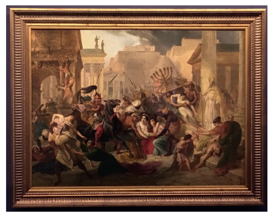
Fig. 8. Karl Pavlovich Bryullov, Sack of Rome by Genseric in 455, 1833–1835, Vatican.