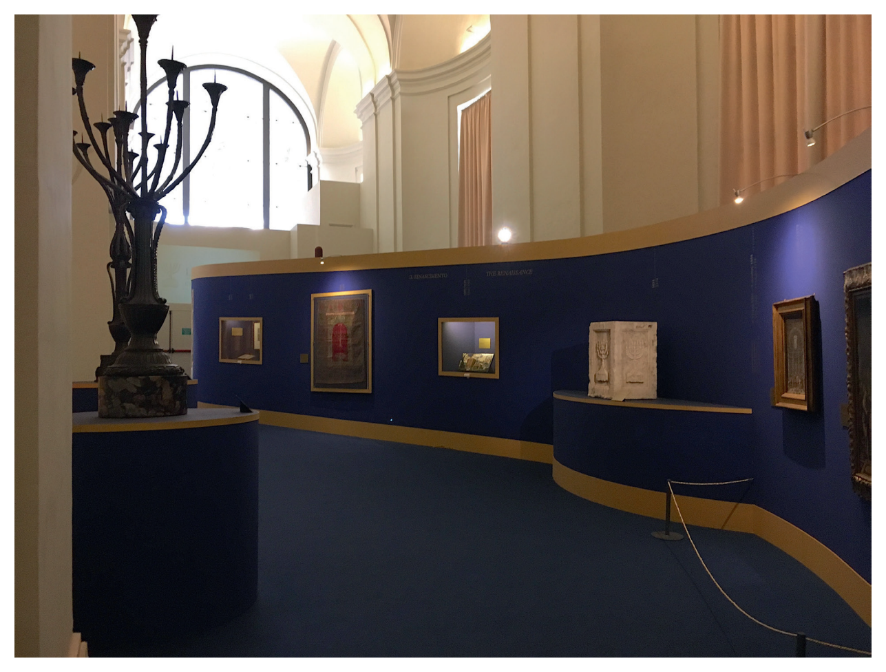
Fig. 5. Steven Fine, "The Menorah during the Renaissance," La menora exhibition, 2017, Vatican, Photograph.