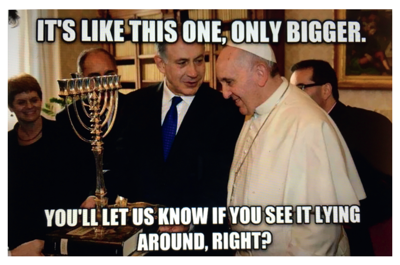
Fig. 9. Internet meme based upon a photograph of Benjamin Netanyahu and Pope Francis, December 2, 2013. https://2.bp.blogspot.com/-zky97PTyb-c/WGj2ICWOMAI/AAAAAAABu88/cqPIJPwOomsSMcimxcocQLxDDAexeWLjwCLcB/s1600/Netanyahu%2Band%2BPope%2BFrancis.jpg.

widespread, and one nineteenth-century opinion, not mentioned in the exhibition or the catalog, has it that Constantine dumped the menorah into the river from the Milvian Bridge, a piece with his conversion to Christianity. The legends associated with the Visigoths are the only literary traditions—beyond the Bible itself—to find expression in La Menorà . This point is worthy of reflection.