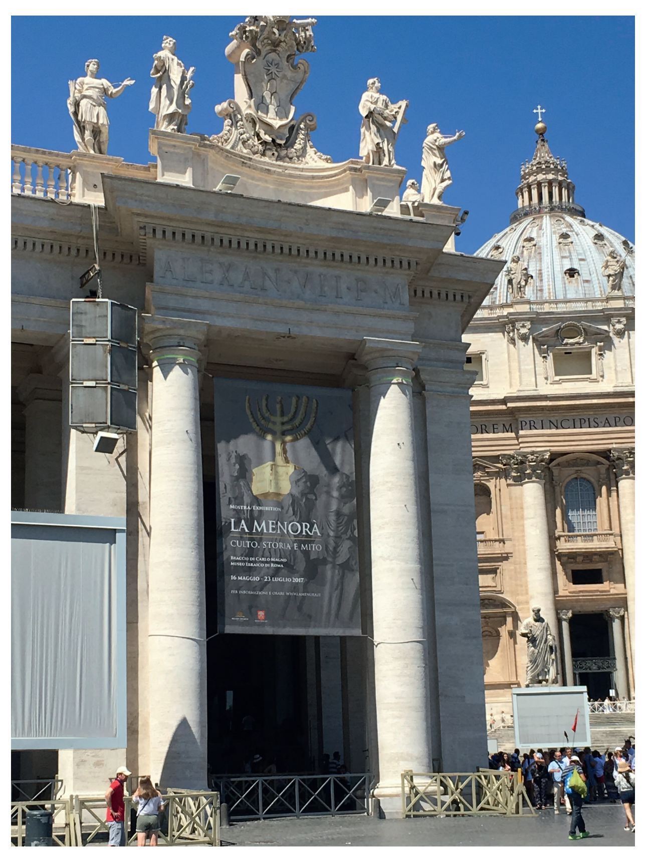
Fig. 1. Steven Fine, La\ menora in Saint Peter's Square, 2017, Vatican, Photograph.