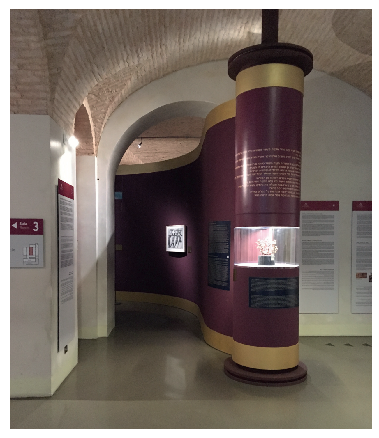
Fig. 2. Steven Fine, Entrance to the exhibition at the Jewish Museum, 2017, Rome, Photograph.