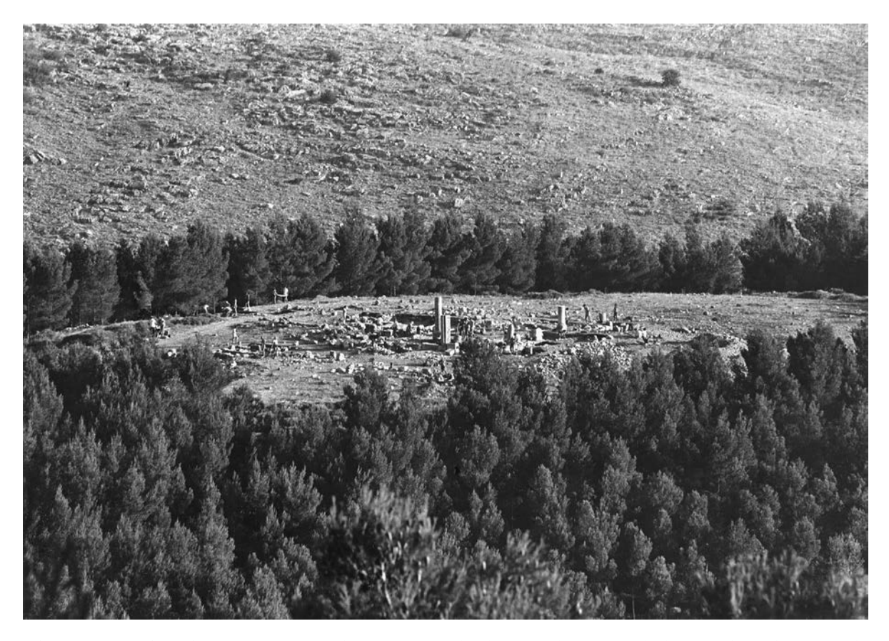
Photo 3. View of site during excavation and restoration work taken on July 4, 1980, looking north-northwest, at edge of Nahal Dalton.

Nevoraia.<sup>1</sup> A connection between Jacob of Kefar Nevoraia and Nabratein was noted by medieval Jewish pilgrims to the Holy Land as early as the mid-thirteenth century CE, and this association continues to the present (Irshai 1982/83: 156 n. 17; cf. Meyers, Strange, and Meyers 1981c: 3; Yaari 1976: 91, 141, 434; Ilan 1997: 295). Typical of the medieval accounts, an anonymous student of Nachmanides who visited the site in 1272 wrote that: