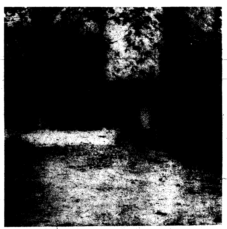
Lexington Avenue view of the lot shows weeds and dirty doors.

Other planned improvements in existing facilities include rearrangement of lounges in the dormitory building to provide a most leisurely and tasteful area for the dents to congregate and bring their guests.