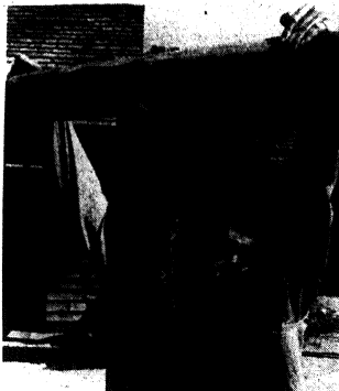
An example of the type of treatment which Stern Dorm Counselors are used to.

Q: Name two problems students may face and suggest a possible solution.