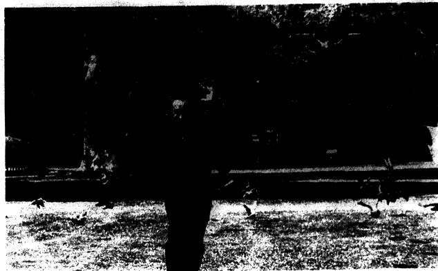
The type of treatment a student of Y.U. can generally expect from the University Administration.