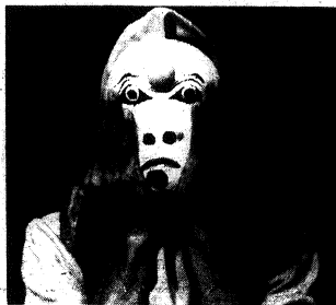
Typical expression on the face of the factory "Peeping Tom" upon confronting SCWSC's solution.

MEM: How come you didn't wear your shorts at the wrestling match?