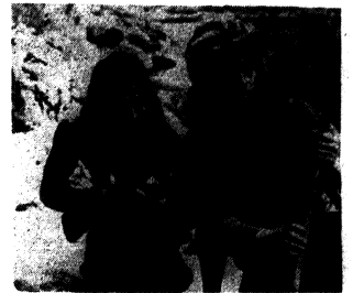
Outdoor activities of YUMB.