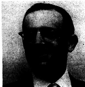
The typical Y.C. "Frummie."

Follow this advice carefully, and you will soon have for yourself an authentic Y.C. boy of your own. Good luck!!!