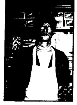
thought that would be a nutritious and innovative idea," explains Shai. "But we'll have to discuss it

taking an informal poll among women at SCW, to get a sense of where the market lies. "YU suggested that I offer some fried-food varieties; the administration