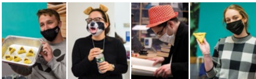
Students on Wilf and Beren Campuses celebrate Purim.