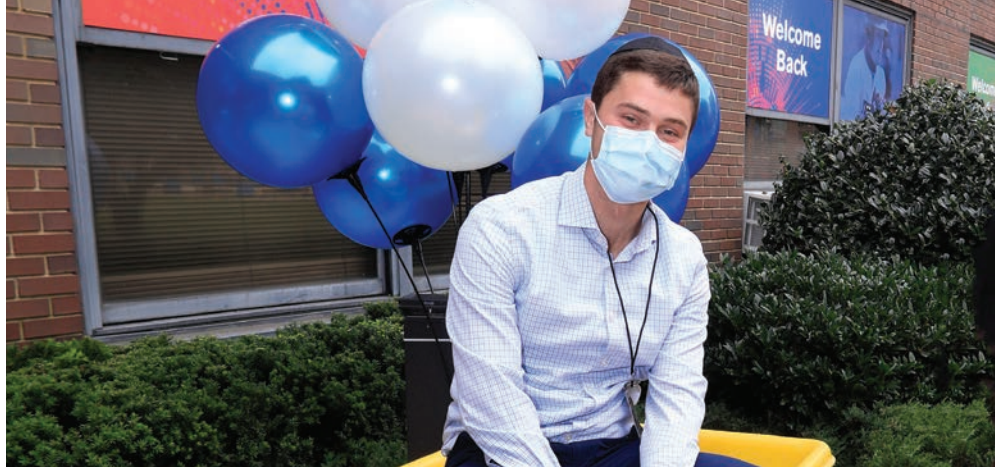
Wilf campus student happy to be back as he joins classmates moving into the dorms.