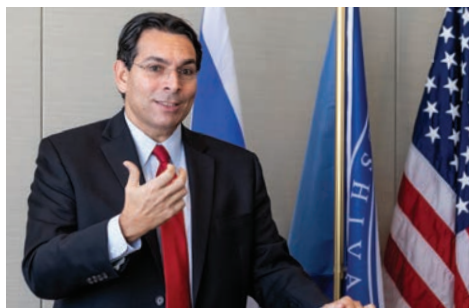
Ambassador Danny Danon addresses YU students in 2018.