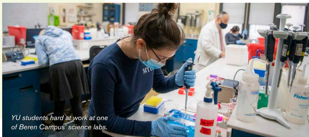
YU students hard at work at one of Beren Campus' science labs.

applying for the current round of Paycheck Protection Program funding disbursed by the federal government.