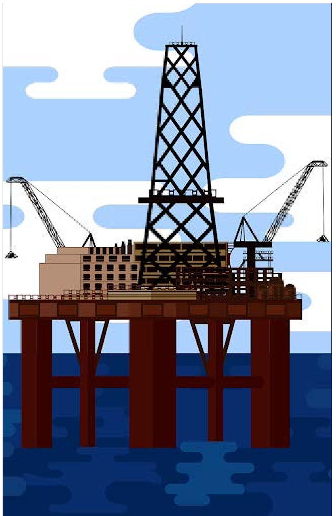
The global oil industry was the pandemic's first victim

The geopolitical effects of the coronavirus which began in Wuhan, lead to the indecision of the world's most powerful cartel in Vienna and affects mom and pop oil businesses in Texas. This complex pattern of dominoes demonstrates just how intertwined oil is with our everyday living and affords people the opportunity to see how valuable this limited commodity really is.