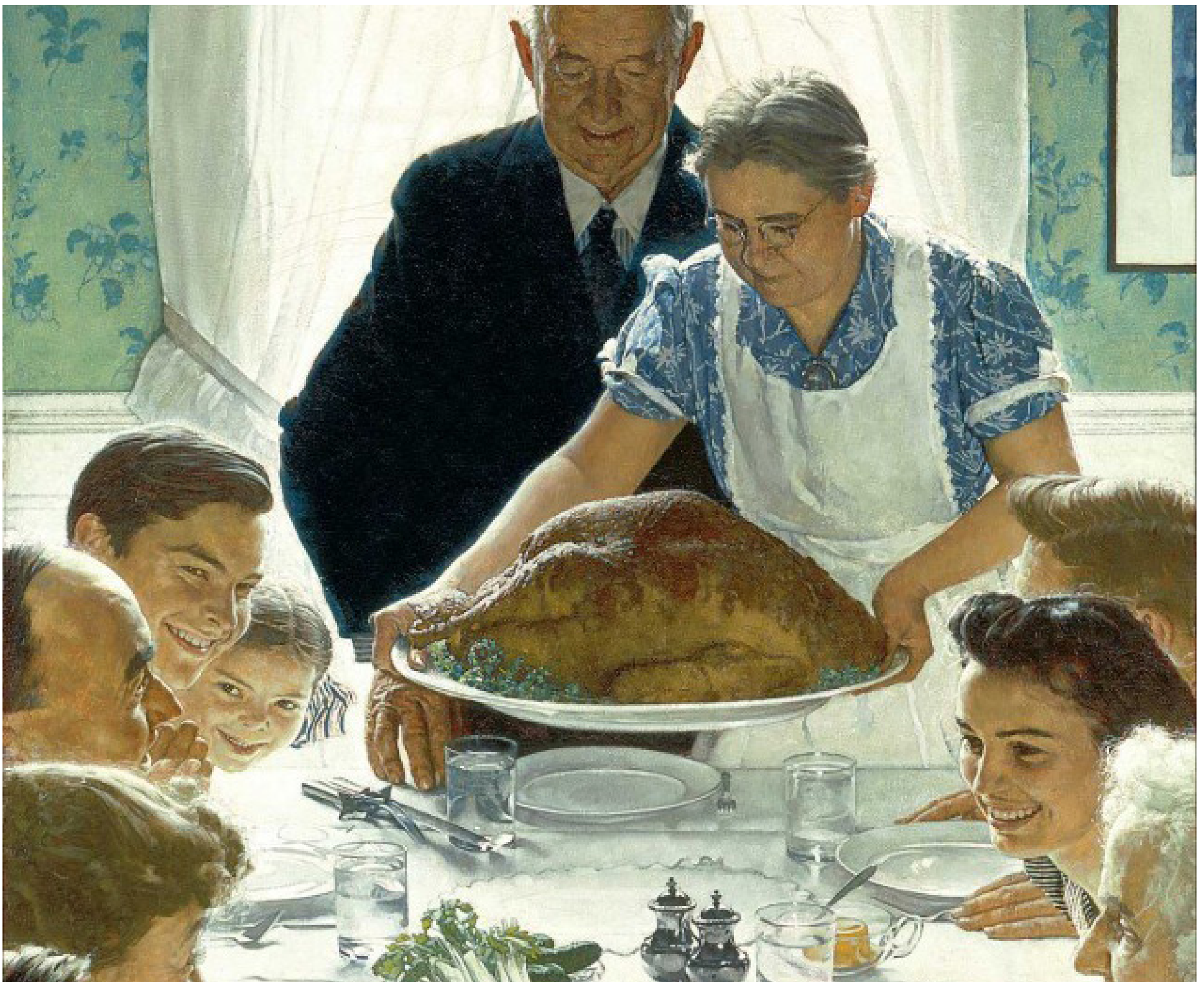
"It's a desire to return to those Norman Rockwell days..."

we have been granted in this land of golden opportunity should not become distorted by selfish desires of betterment at the belittlement of our fellow community members. We work on ourselves and yes, we are all entitled to a life full of liberty and the pursuit of our own happiness, yet why should we ignore our communities for a short-term gain. To quote a proverb from Ancient Greece, the forebearer of our modern democratic system, a society grows great when old men plant trees whose shade they know they shall