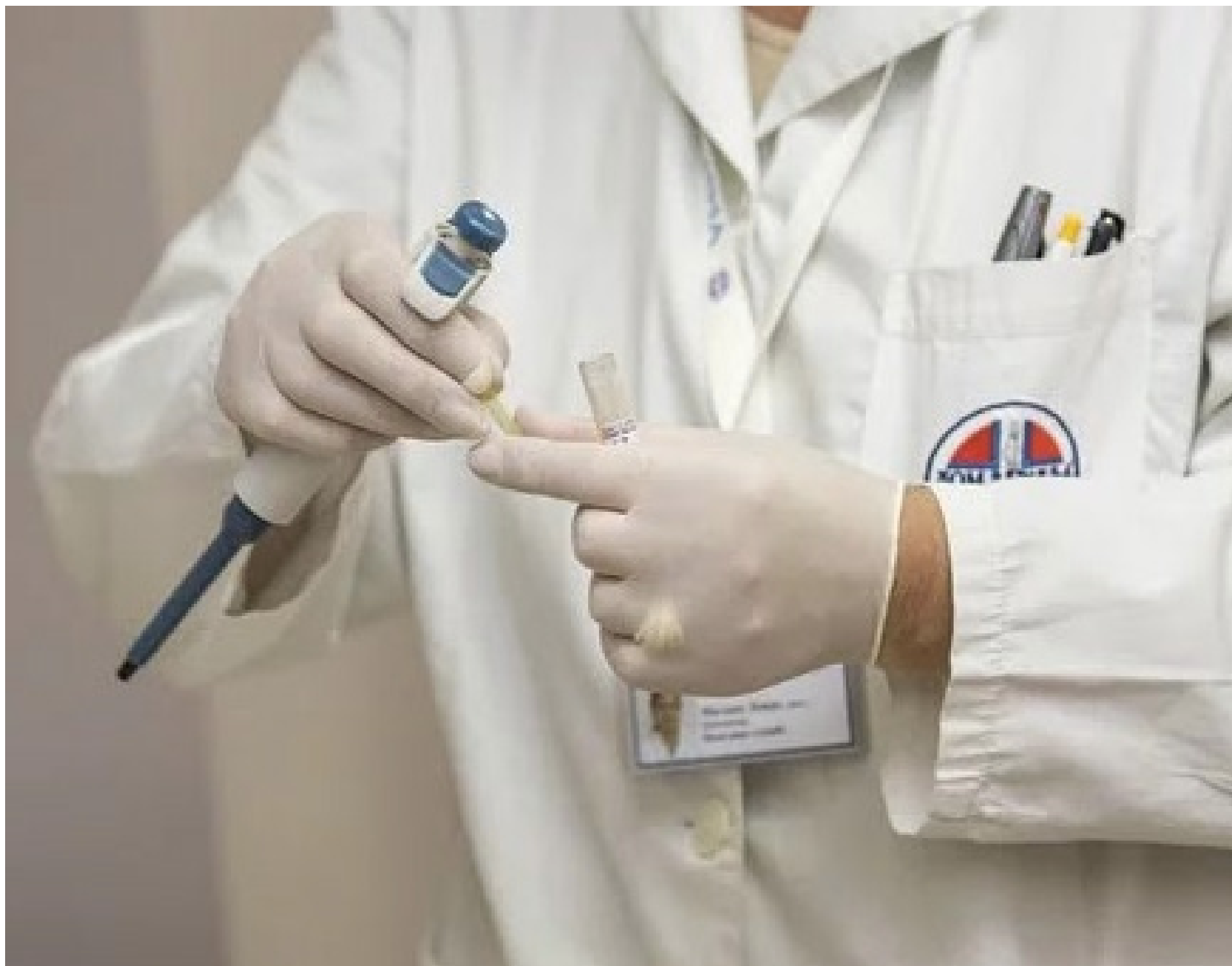
Support for physician-assisted suicide has increased in recent decades.