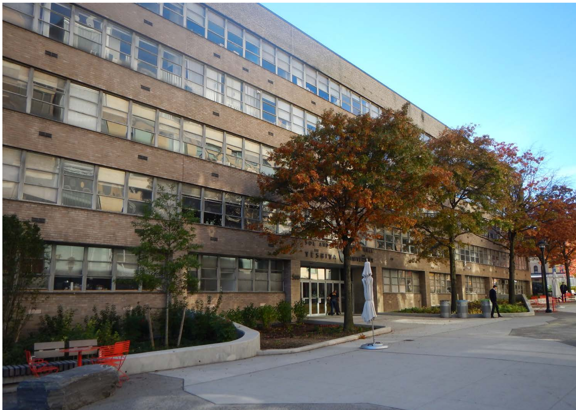
Furst Hall on Wilf Campus

It is important to not only keep our relationships with close friends strong, but to also think about those who might not be