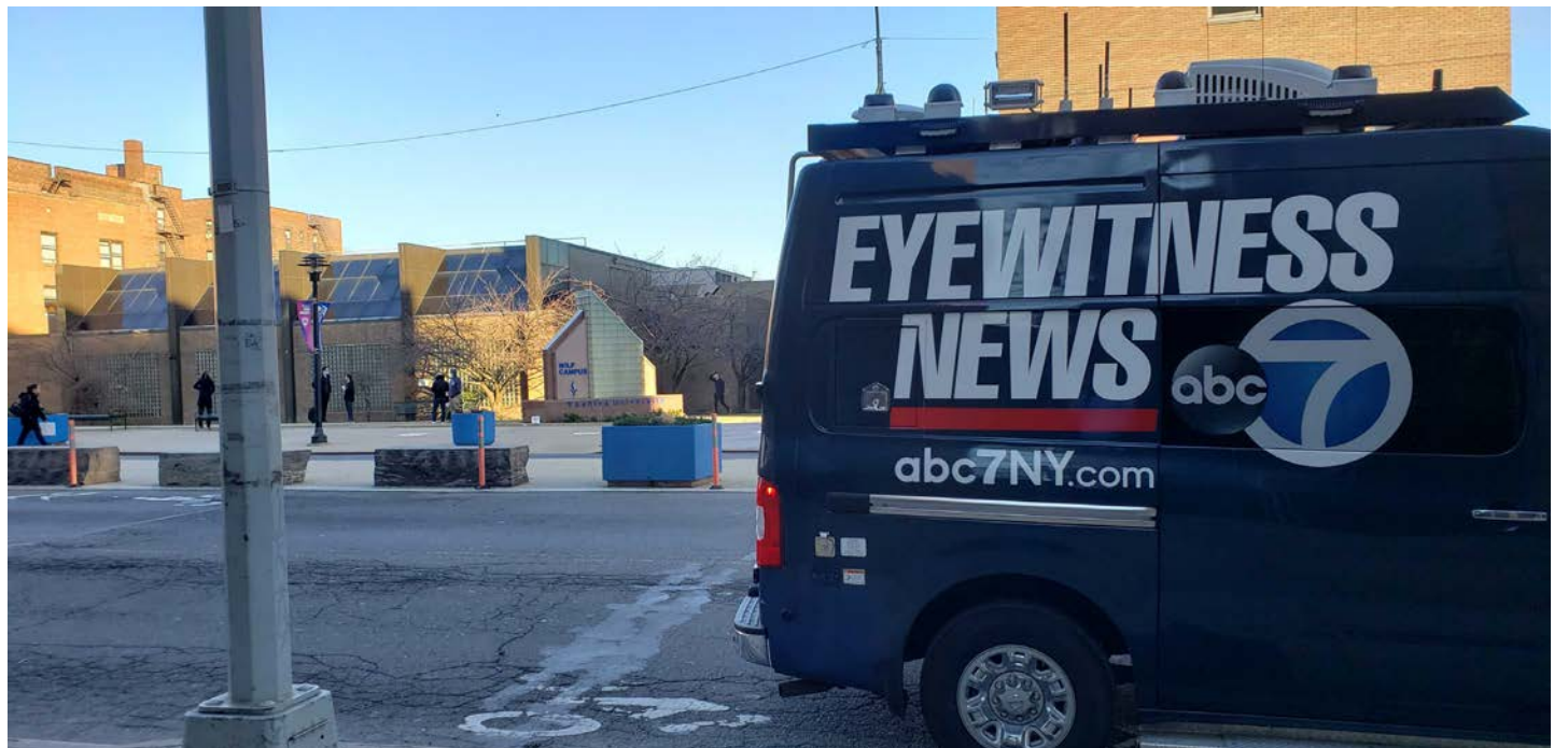
Media presence at the Wilf Campus on Wednesday, March 4