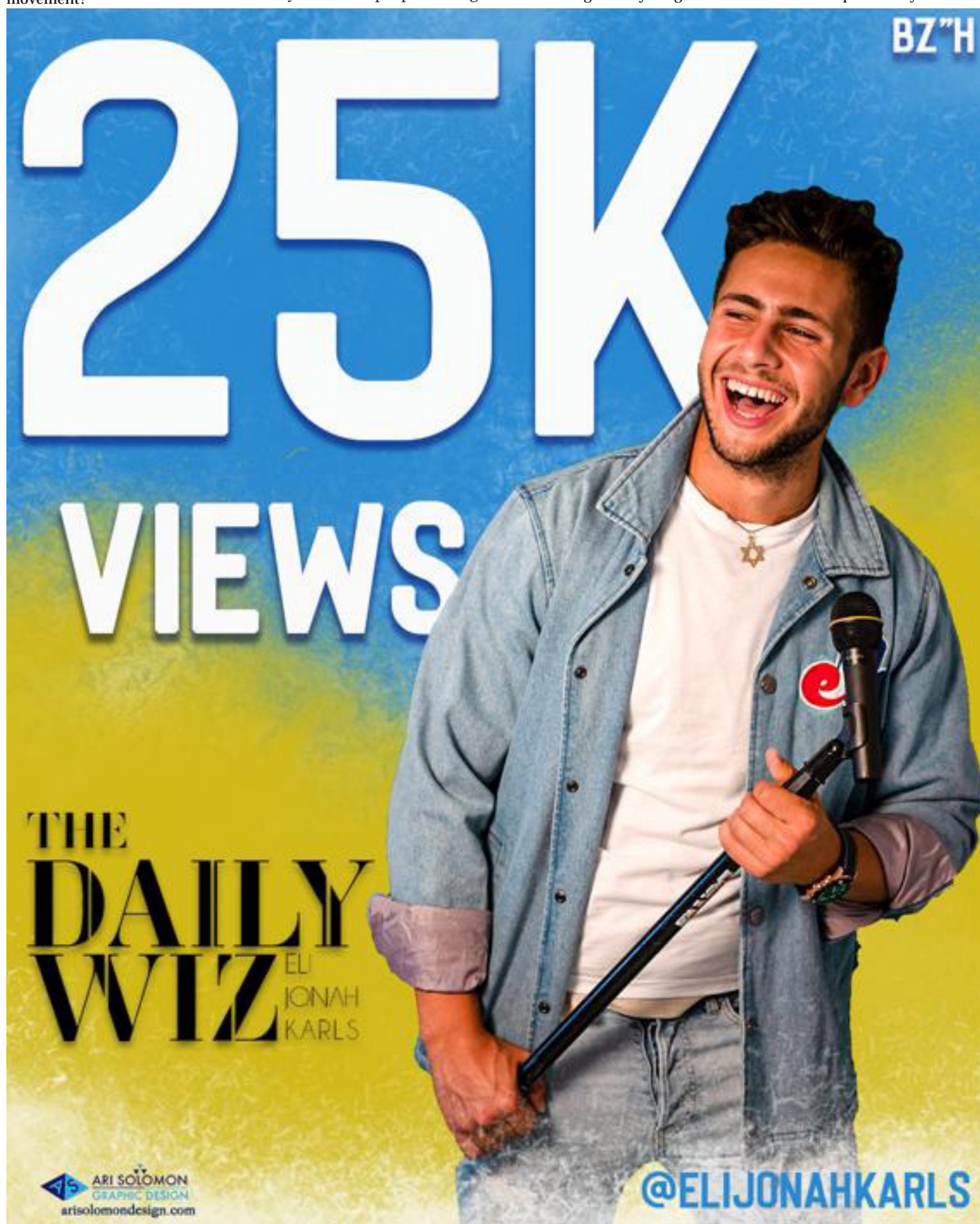
The Daily Wiz has recently reached 25,000 total views.