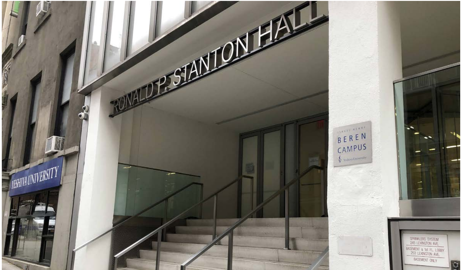
In-person classes have not been in session since March 4.

For Sy Syms School of Business (SSSB) and Katz School undergraduate students, this option will be limited to two courses that do not fulfill any major or minor require-