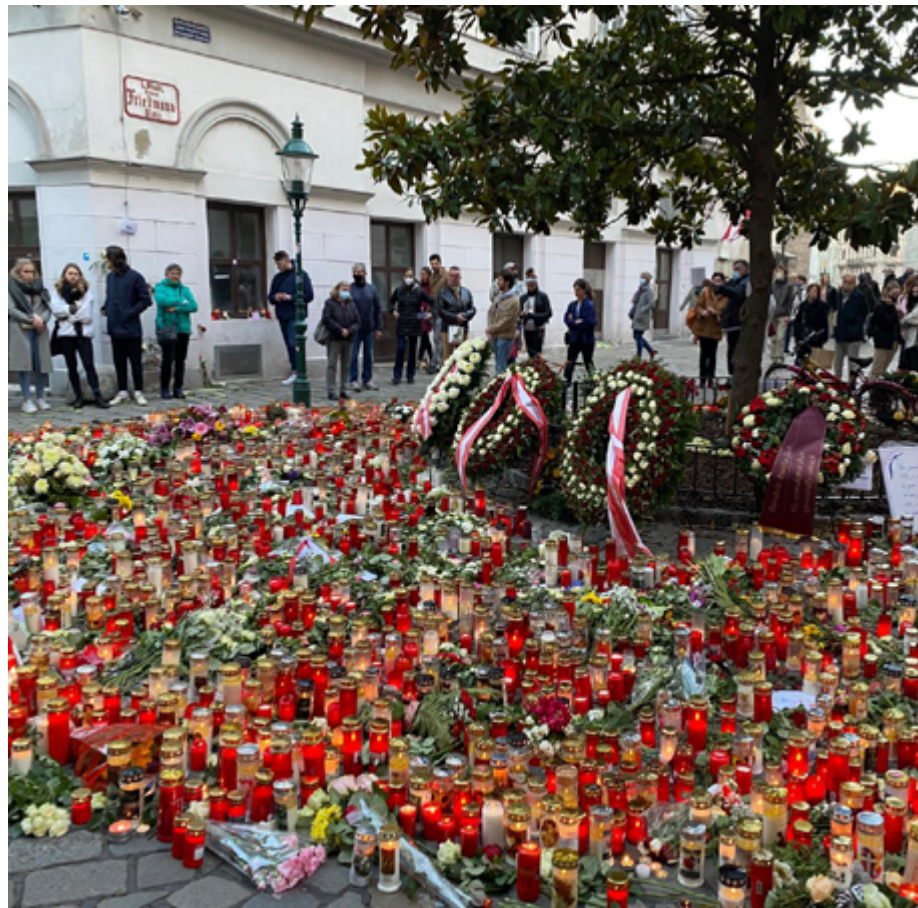
Seitenstettengasse, a few days after the Nov. 2 attack in Vienna

I remember some terror attacks more vividly than others; in 2012, a terrorist killed a rabbi and three schoolchildren at the Ozar Hatorah school in Toulouse, prompting 12-year-old me to reflect on what it means to be a Jew in Europe. The photos that emerged after the 2014 attack on the Kehillat Bnei Torah shul in Har Nof still haunt me until this day. In 2015, the Hypercacher kosher supermarket in Paris was put under a siege, just days after the Charlie Hebdo massacre. More recently, a mass shooting took place in the Tree of Life Synagogue in Pittsburgh, marking the deadliest attack on the Jewish community in the U.S. As we approach Chanukah, the Jewish community