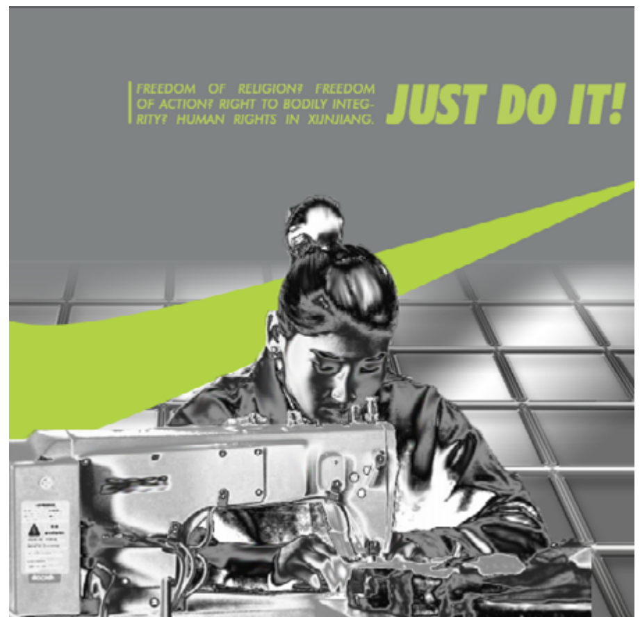
Nike is one of many companies lobbying against the Uyghur Forced Labor Prevention Act.

To take action, email ifruchte@mail.yu.edu and check out the Jewish Movement for Uyghur Freedom.