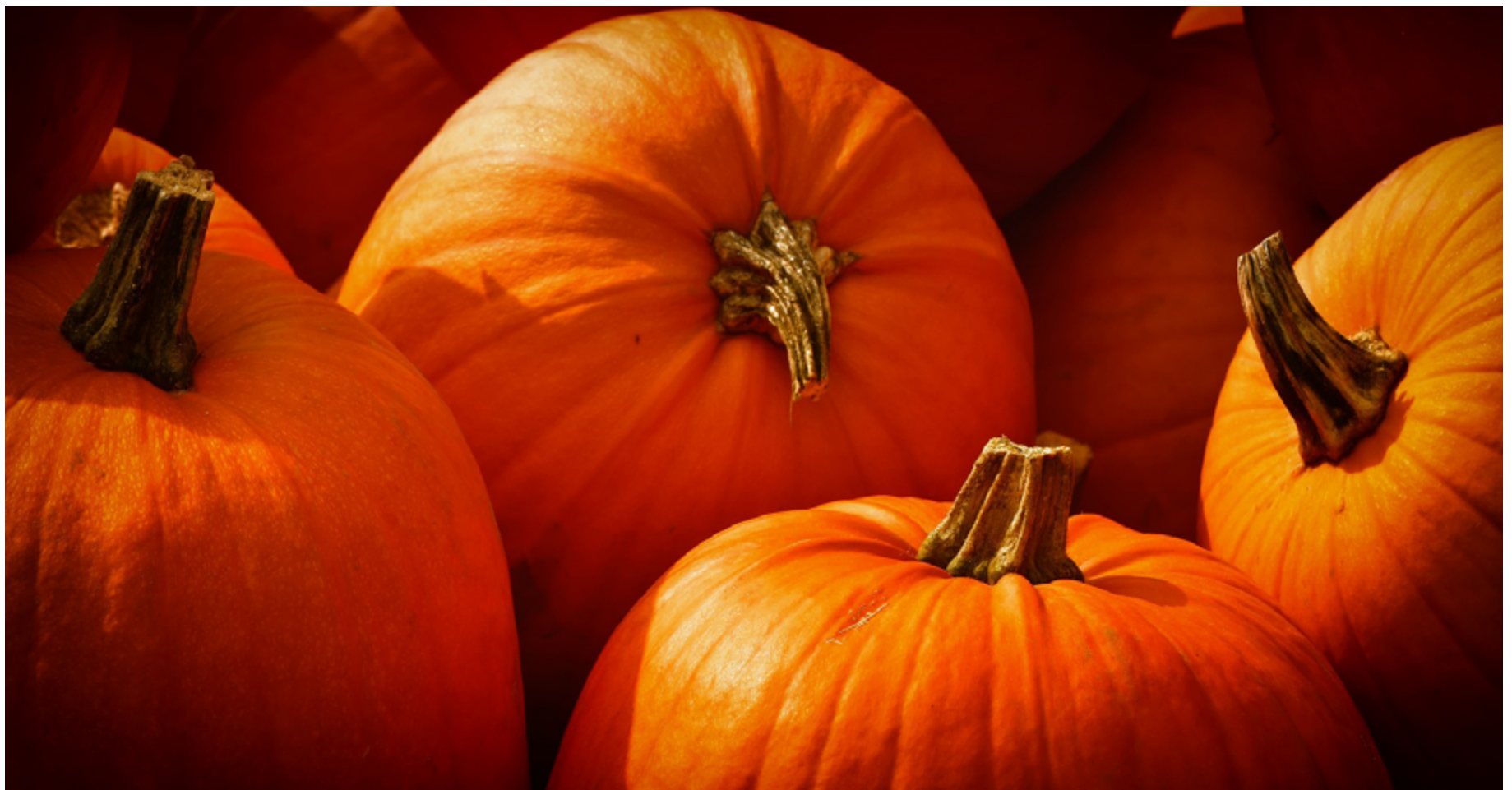
For many of YU's out of town students this year, a normal Thanksgiving at home was out of the question.

But Thanksgiving at YU isn't just about the food. There were four shiurim held on