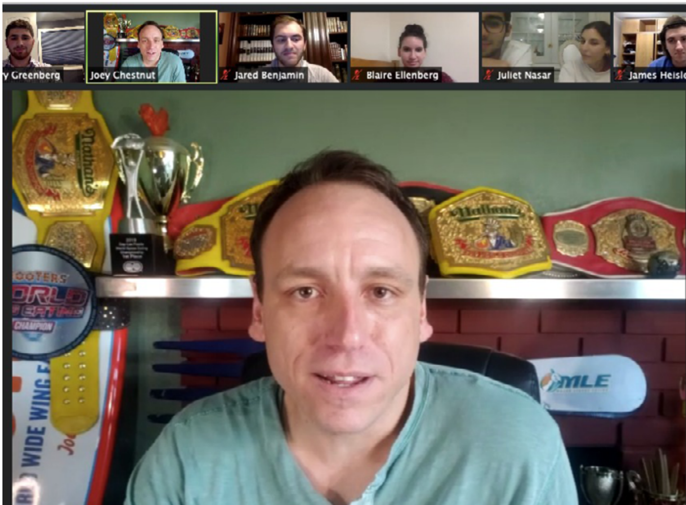
Chestnut holds over 40 competitive eating records in the world.