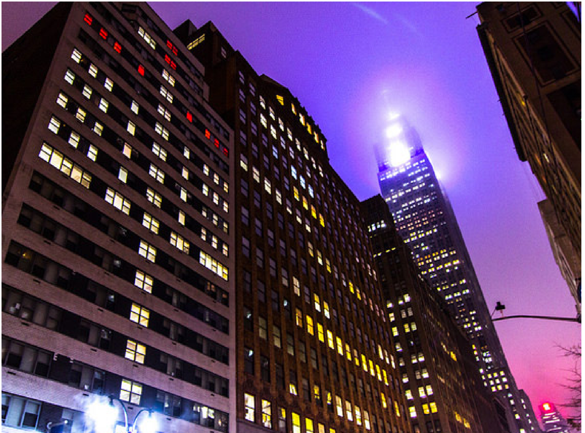
Brookdale Residence Hall