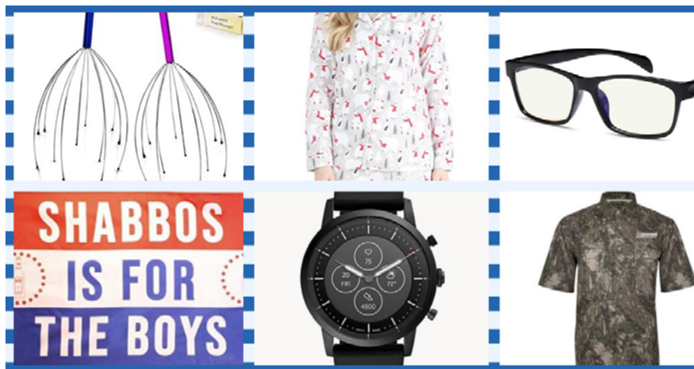
All Commentator staff members had the chance to share a Chanukah gift idea.

The Commentator wishes our readers a Chanukah Sameach!