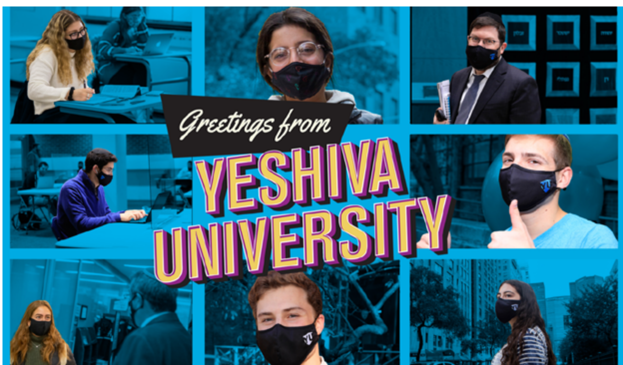
YU graphic of current life on campus.

"Assuming the COVID-19 cases don't spike and NYC isn't all but shut down, my hope is to live on campus next semester. It's hard to say whether or not this will happen given the rising cases across NYS and even in YU, the latter of whom was doing really well for the first month. For now, it's definitely going to be a wait-and-see type of thing."