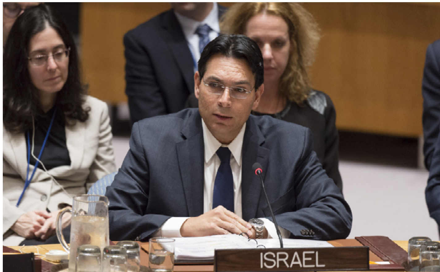
Danny Danon has been named a visiting professor in YU's Political Science Department