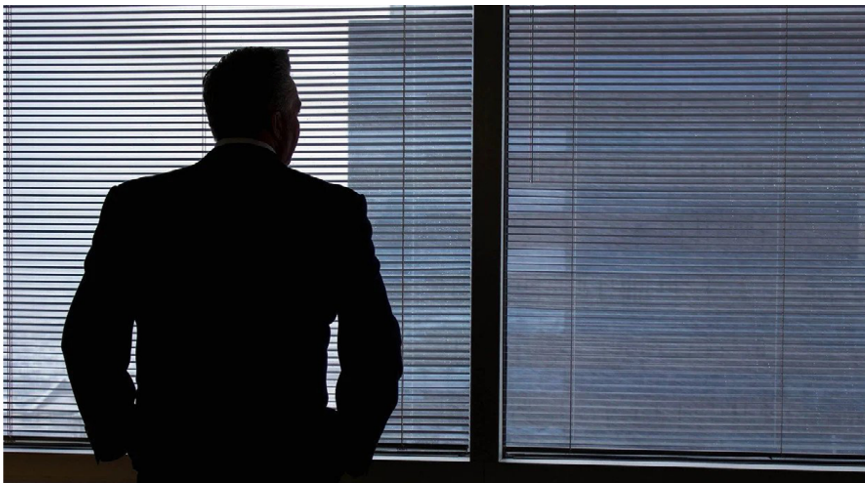
The enigmatic nature of SPACs prevents investors from knowing what they truly are and often this elusive complexion bars the SPACs themselves from knowing their very own identity.

Perhaps it is no surprise that of the 71 SPAC-acquisitions completed so far in 2020, 15 purchased companies that had no revenue in 2019, and the average return on SPAC investors' common stock has been a loss of 1.4%, according to research and investment management firm Renaissance Capital. These "shots in the dark" in which investors have financed somewhat blindly in SPAC's instead of in public companies whose project earnings are more legitimate and trustworthy suggests a rather pessimistic outlook for the medium-long-term future where American investors may start to find economic less creativity, less technological innovation, and, ultimately less profit.