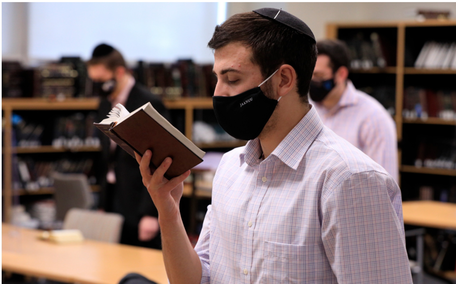
Shabbos programming returns to the Wilf and Beren campuses.