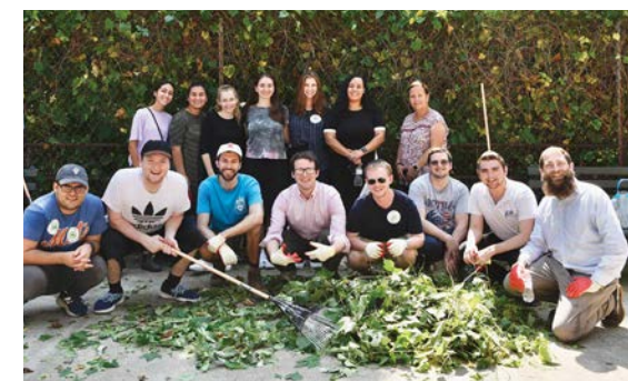
YU students volunteer at Highbridge Park.