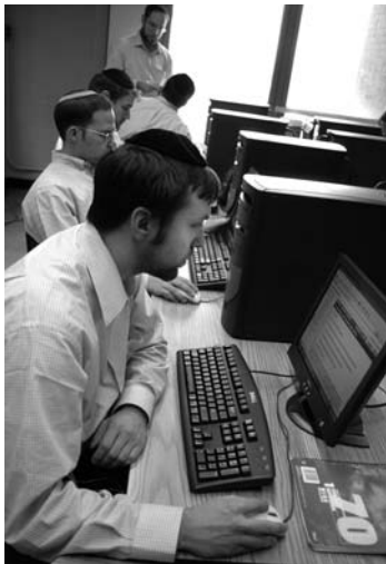
Teachers learn to use Angel.

Imagine a fledgling Jewish day school in a small Jewish community a thousand miles from New York City. With limited access to educational resources and few teachers qualified to teach advanced Jewish studies, a quality Jewish education would no doubt be hard to come by.