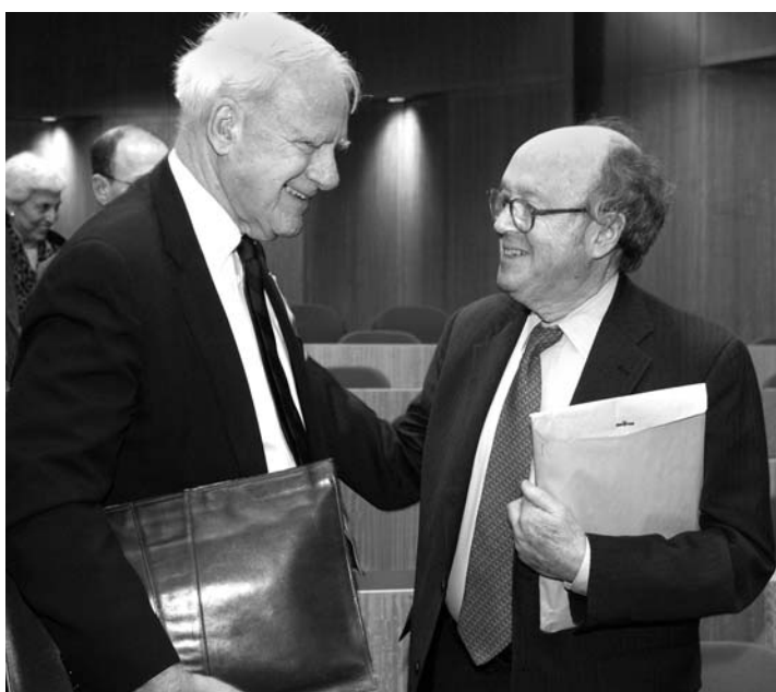
James R. Schlesinger, US Secretary of Defense in the mid 70s and Secretary of Energy in the late 70s, and former New York Times columnist Anthony Lewis.