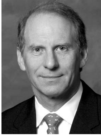
Dr. Richard N. Haass

The best universities provide a framework within which students can explore current events and learn from leading scholars and experts who shape tomorrow's history.