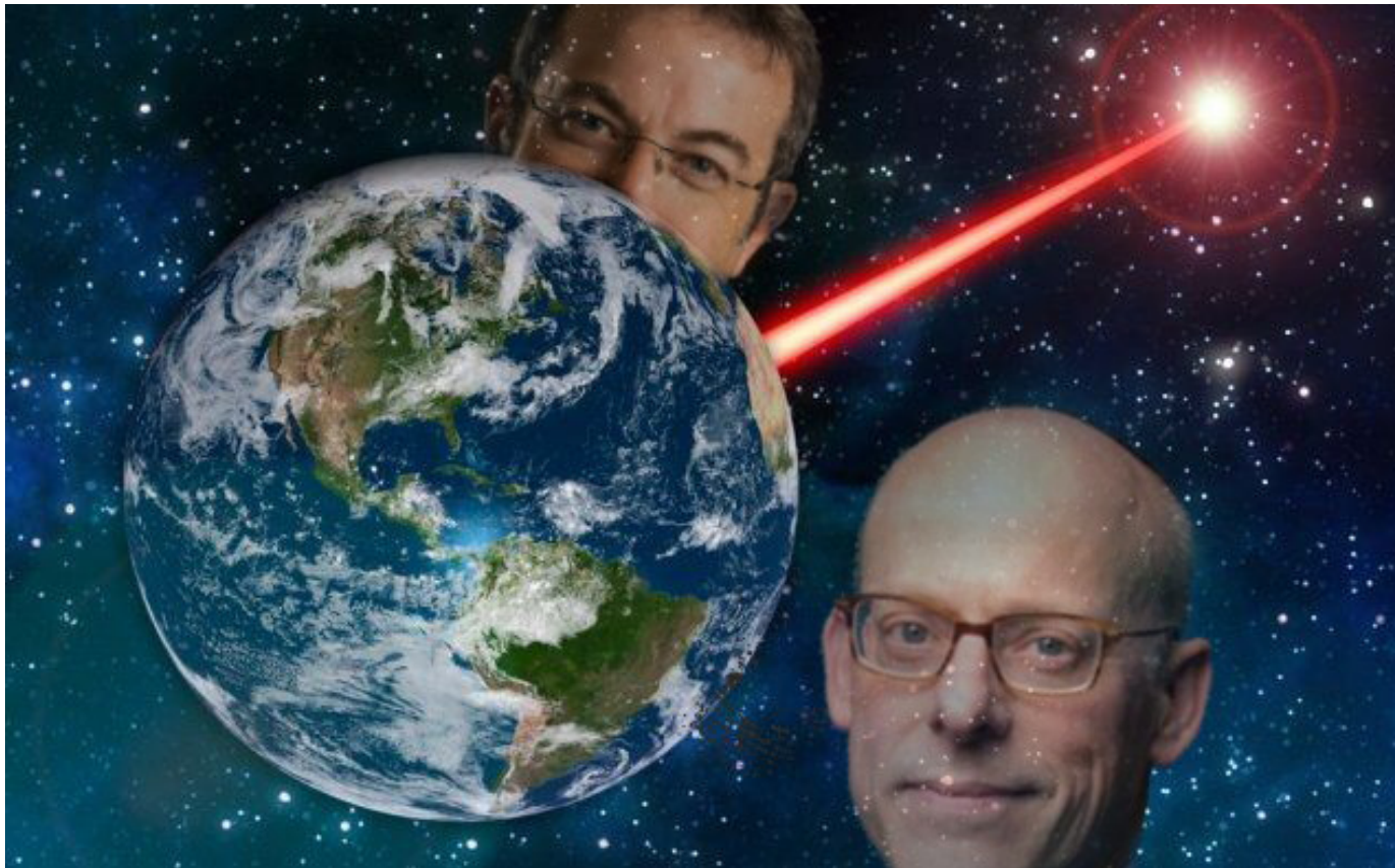
The Jewish space lasers have been met with a bang.