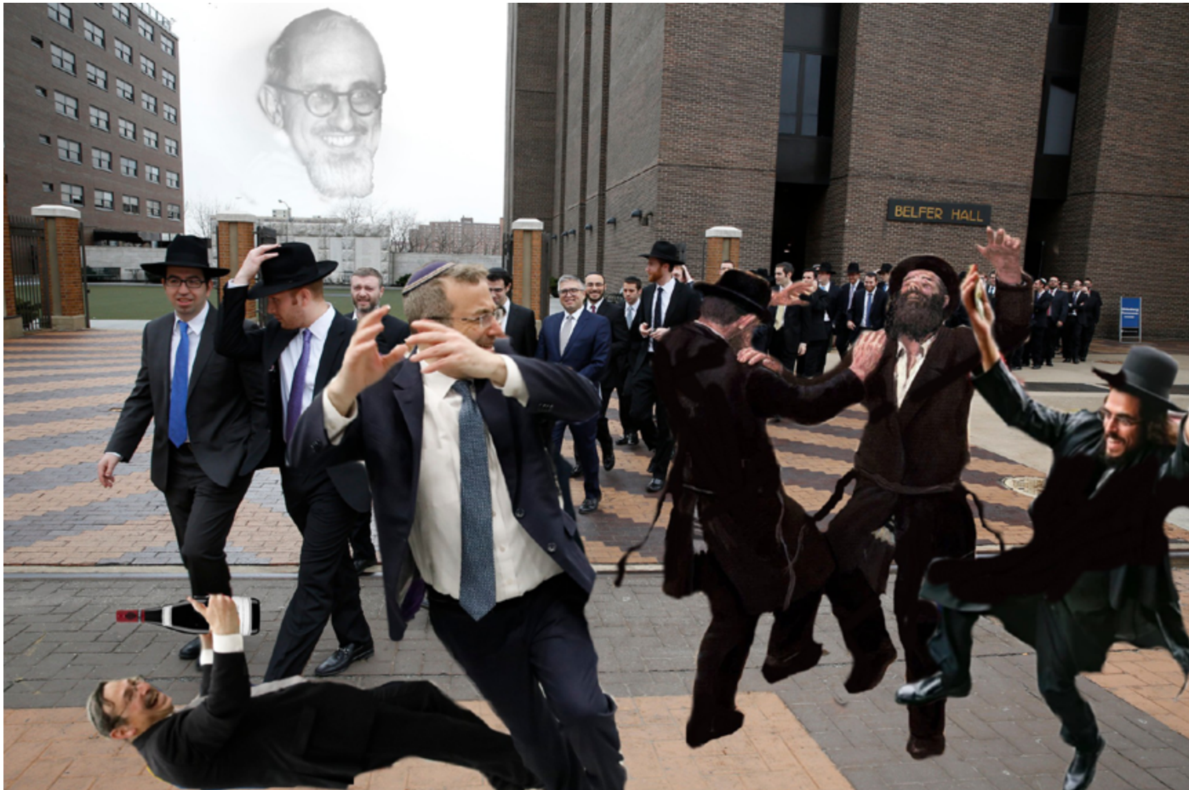
Chassidim infamously protested last year's chag hasemicha by dancing in front of the musmachim. One can see the "Snags" walking in orderly formation, undeterred by the yoideling yoiles. Full story on page 3.