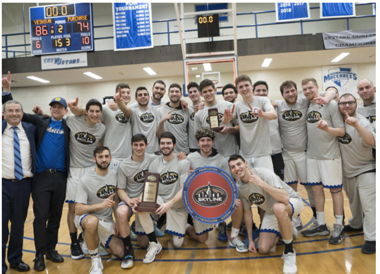
The Yeshiva University Maccabees have elected to play in the upcoming Red Sarachek High School Tournament