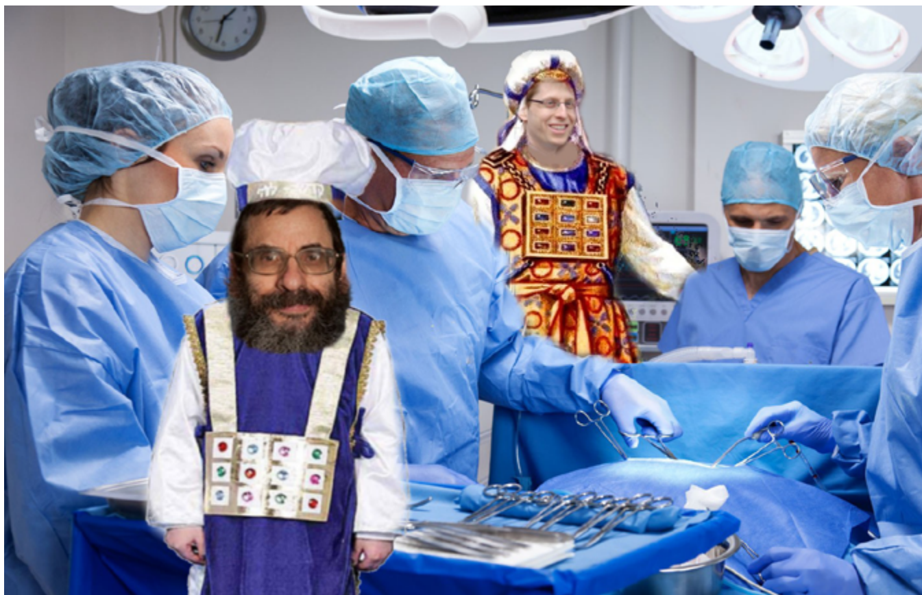
The new medical track has attracted many faces.