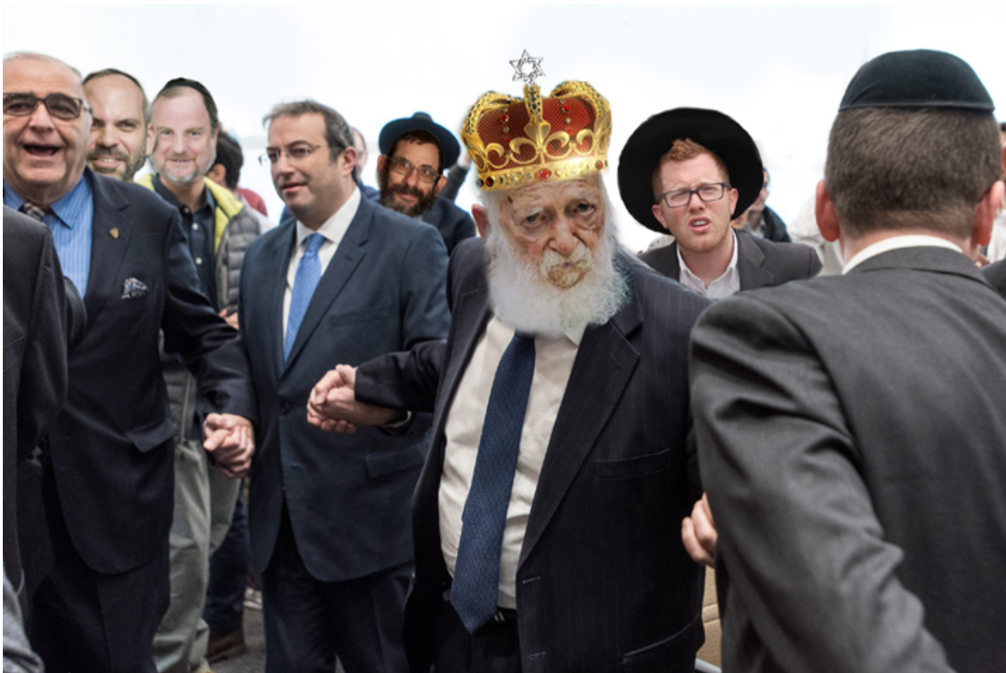
A photo from an event that was almost covered in The Coronater, but then we got lazy.