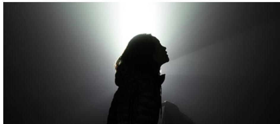
The controversial ObserveHer article caused many readers to sigh.

The Coronator will not shy away from controversy, but we will also not actively seek it. Some consider us kefira , others claim we are "the prudish paper on campus." Either way, if you believe your perspective has been overlooked, there is a simple fix: submit your overly-revealing and explicit article to The C.