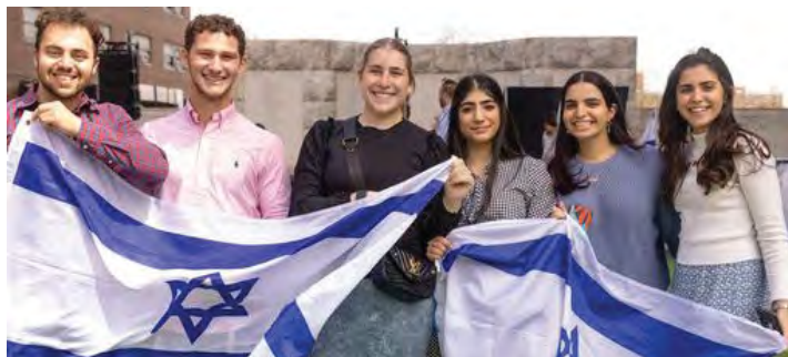
Students celebrate Yom Ha'atzmaut.