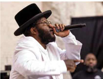
Nissim Black performs at YU's "Shuk Experience."