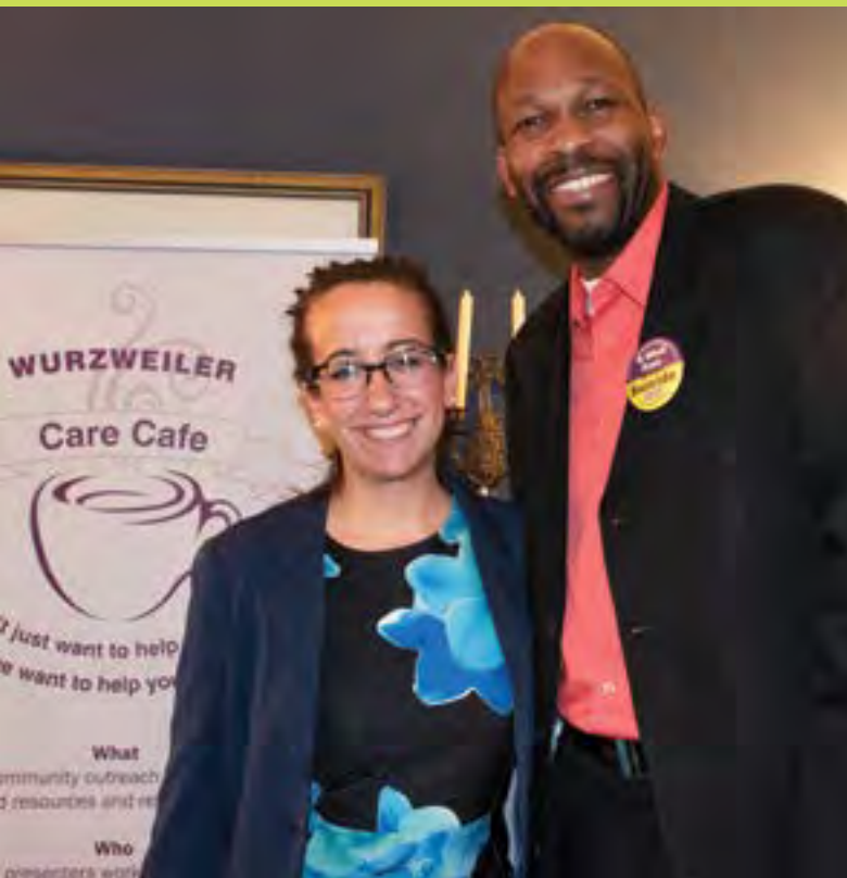
Wurzweiler School of Social Work's Care Café provides psychoeducational pop-up support in the community.