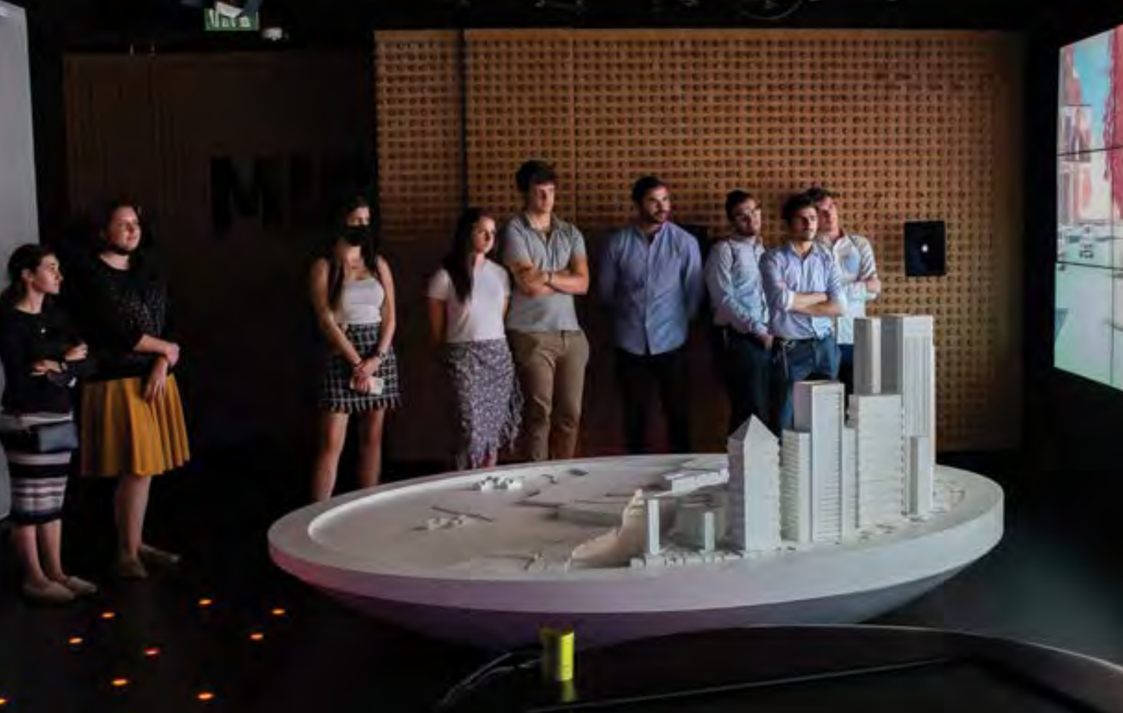
YU student interns attend a startup presentation in Jerusalem.

Y eshiva University is an institution with a glorious past. With thousands of graduates since its founding in 1886 and deeply rooted in a multimillennial tradition that has been passed down through generations, YU has prepared students in countless fields who have gone on to have exciting, productive and impactful careers.