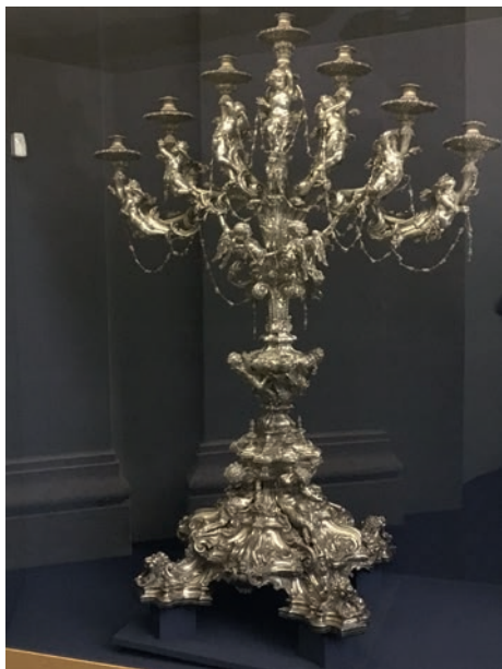
Fig. 6. Steven Fine, "The Seventeenth Century and the Baroque World," La menora exhibition, 2017, Vatican, Photograph.

labras from the cathedral in Mallorca, and Poussin's 1638 version of The Destruction of the Temple in Jerusalem (in Vienna). A wide selection of Jewish liturgical artifacts that referenced the menorah, mainly Italian, followed in "The Menorah in Jewish Decorative Art and Ceremonial Ornaments: From the Ghetto Period to Emancipation" (fig. 7). The path continued to "The Nineteenth Century," which highlighted the Visigoth sack of Rome. This was splendidly represented in a painting by Karl Pavlovich Bryullov's Sack of Rome by Genseric in 455 (1833–1835), now in St. Petersburg (fig. 8). Perhaps most fascinating was a large stone discovered in the garden of the Great Synagogue of Rome in 1994. This nineteenth-century fake relates that three brothers executed under Emperor Honorius "found the relics of Jerusalem, the candelabrum and the Ark, in the Tiber," and like a treasure map tells how to find them. This hoax was clearly part of an attempt to support plans to dredge the Tiber in search of the lampstand during the nineteenth century. The notion that the menorah was dumped in the Tiber was then