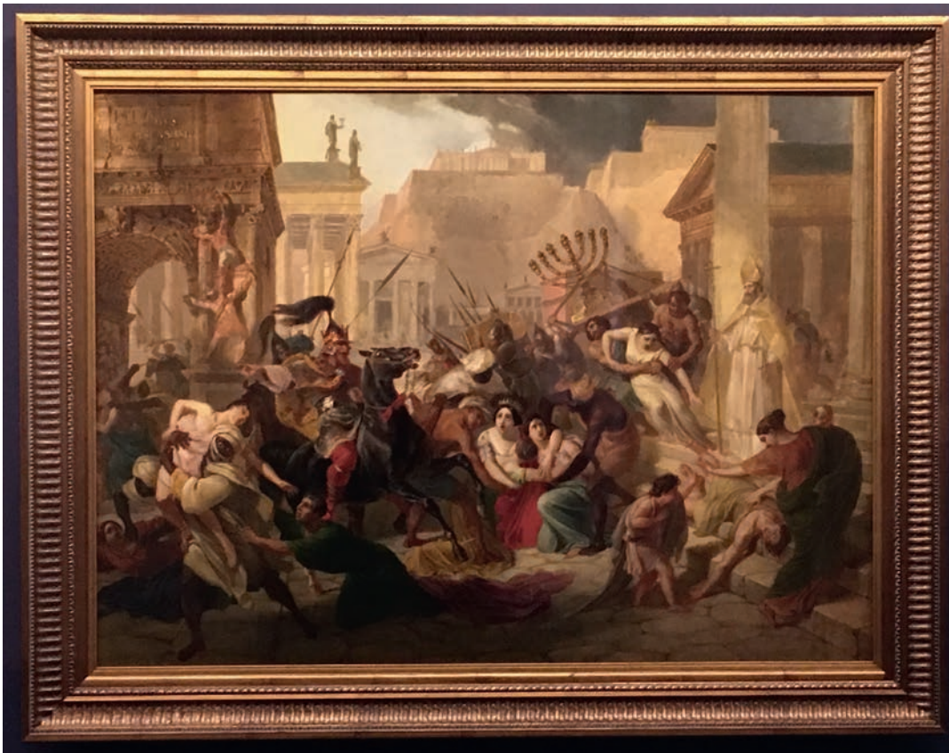
Fig. 8. Karl Pavlovich Bryullov, Sack of Rome by Genseric in 455 , 1833–1835, Vatican.