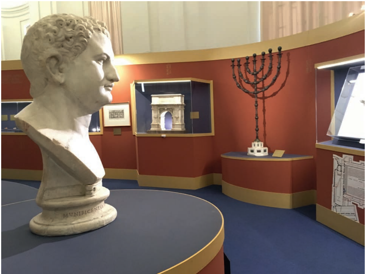
Fig. 4. Steven Fine, “The Menorah in Ancient Art: From Jerusalem to Rome,” La menora exhibition, 2017, Vatican, Photograph.

(ca. seventh century) and a large Christian candelabrum from the cathedral in Paderborn (ca. 1300). This hall contained both Christian and Jewish manuscript images of the biblical lampstand, which were placed side by side, visually asserting continuity between the Jewish and Christian pieces. Of particular interest were the manuscripts of Procopius’s sixth-century History of the Gothic War , which describe the transfers of artifacts from Solomon’s and Herod’s temples from Rome to France and North Africa. Modern scholars and mythologists have associated such transfers with Justinian’s construction of his Nea Church in Jerusalem, although this last notion is a modern construct.