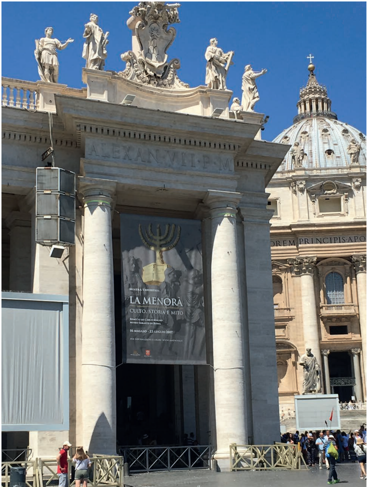
Fig. 1. Steven Fine, La menorà in Saint Peter's Square, 2017, Vatican, Photograph.