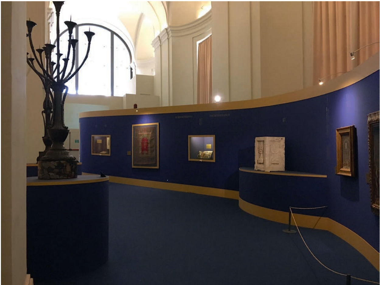
Fig. 5. Steven Fine, "The Menorah during the Renaissance," La menora exhibition, 2017, Vatican, Photograph.