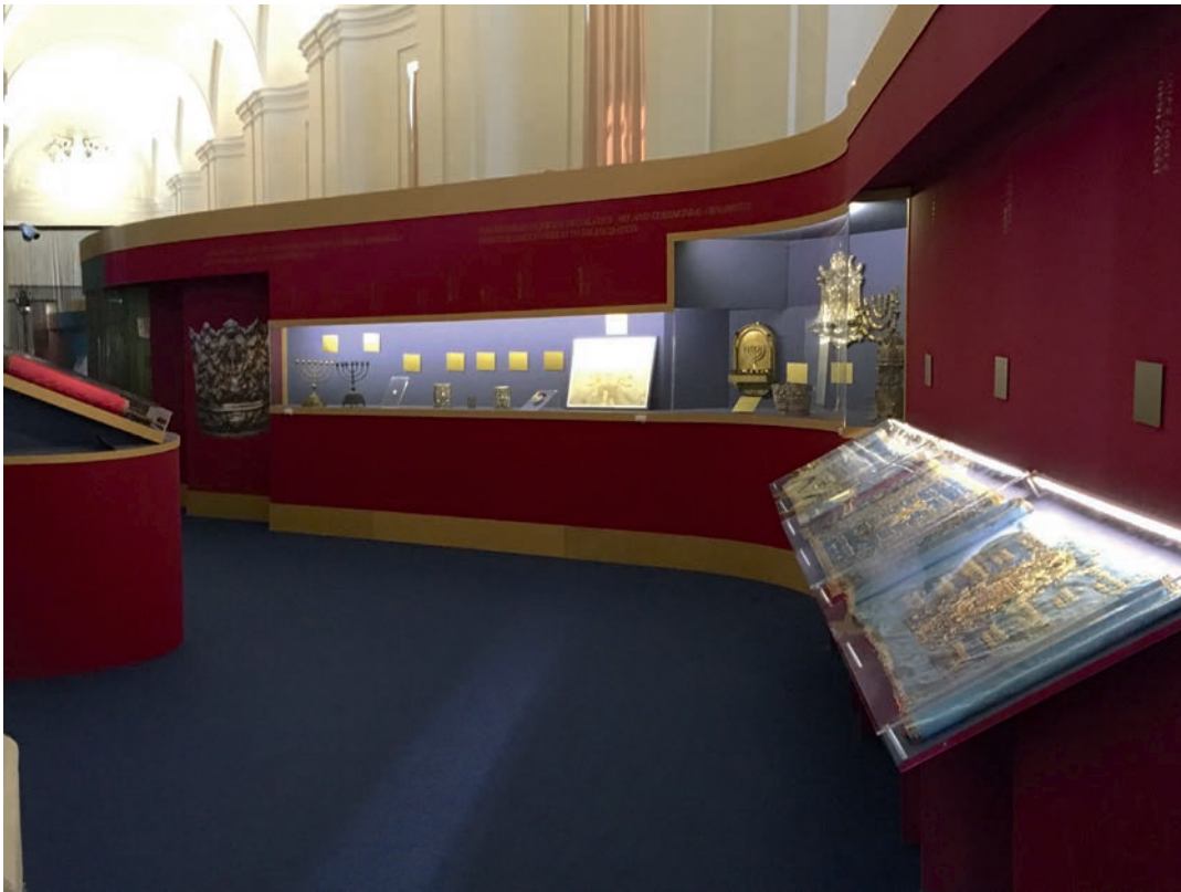
Fig. 7. Steven Fine, "From the Ghetto Period to Emancipation," La menora exhibition, 2017, Vatican, Photograph.