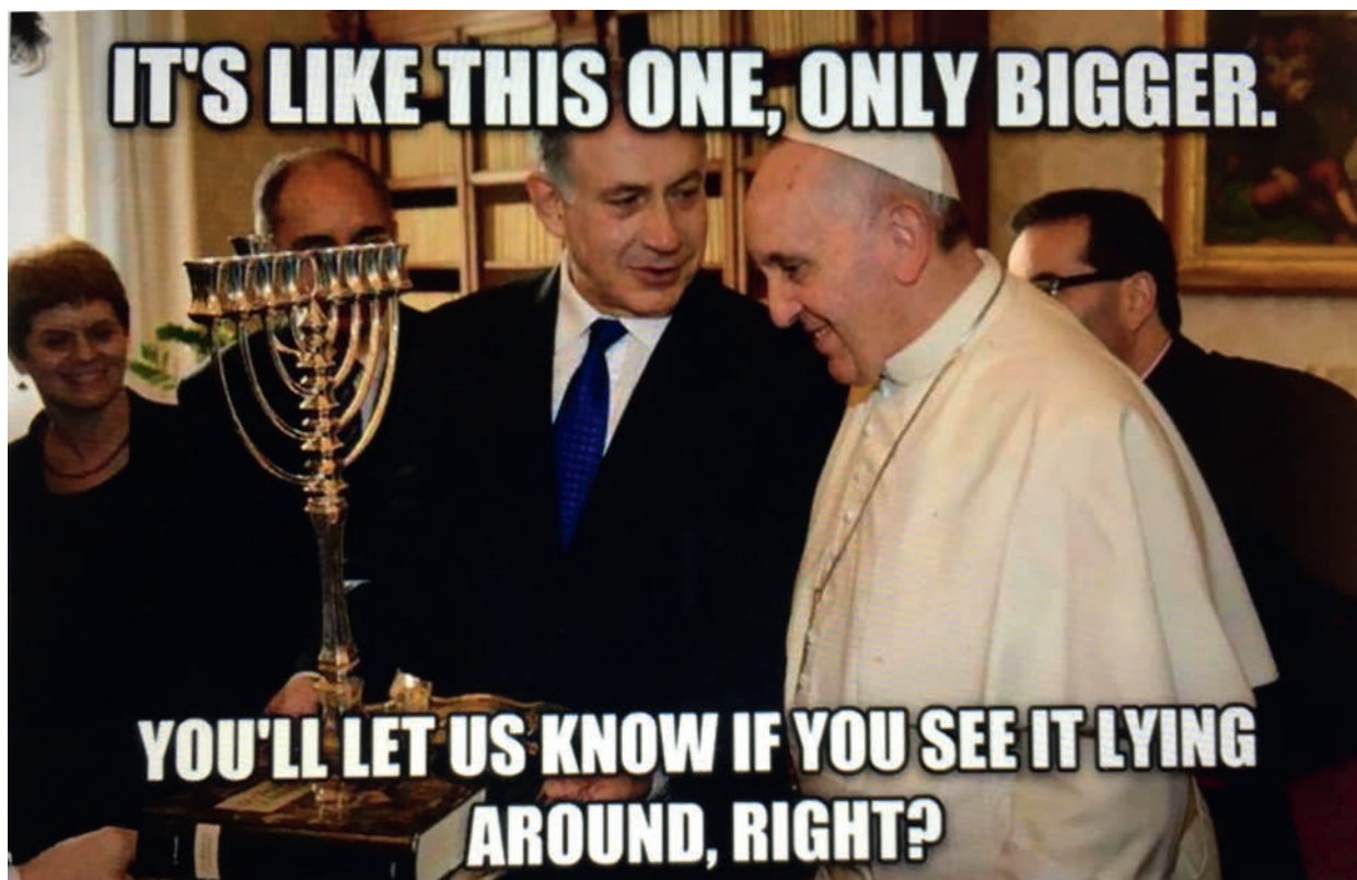
Fig. 9. Internet meme based upon a photograph of Benjamin Netanyahu and Pope Francis, December 2, 2013. https://2.bp.blogspot.com/-zky97PTyb-c/WGj2ICWOMAI/AAAAAAAAABu88/cqPIJPwOomsSMcimxcocQLxDDAexeWLjwCLcB/s1600/Netanyahu%2Band%2BPope%2BFrancis.jpg

widespread, and one nineteenth-century opinion, not mentioned in the exhibition or the catalog, has it that Constantine dumped the menorah into the river from the Milvian Bridge, a piece with his conversion to Christianity. The legends associated with the Visigoths are the only literary traditions—beyond the Bible itself—to find expression in La Menorà . This point is worthy of reflection.