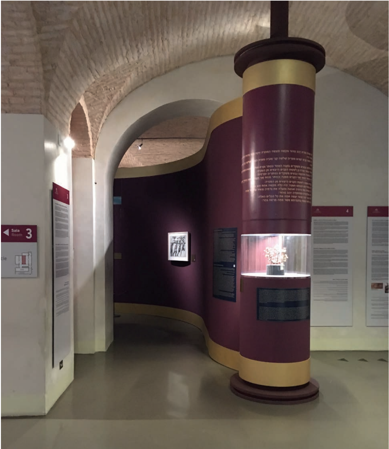
Fig. 2. Steven Fine, Entrance to the exhibition at the Jewish Museum, 2017, Rome, Photograph.