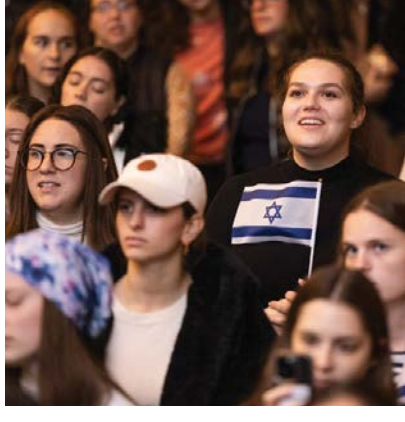
On Oct. 11, over a thousand students, faculty and staff expressed their steadfast support for Israel at the University's "Stronger Together: Night of Unity."