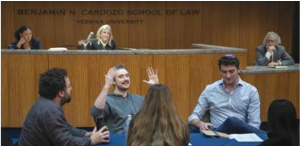
Cardozo students participate in the law school's Intensive Trial Advocacy Program