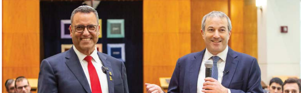
Moshe Lion, Mayor of Jerusalem, and Rabbi Dr. Ari Berman, President, Yeshiva University