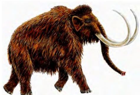
Fig. 1. A wooly mammoth, illustration

“Likewise, in the year 1807, according to their reckoning, they found in Siberia, in the northern part of the earth, under the terrible ice which is ever present there, a great elephant [the wooly mammoth] (Fig. 1, 2), three or four times the size of those found today, and whose skeleton now stands in the Zoological Museum in Petersburg. Moreover, inasmuch as elephants cannot live in the extreme cold which dominates that region, this carcass indicates that by the blow which the earth received and by which it was blasted and disordered, this elephant, which once lived in a warm climate that could support elephant life, was carried to its current location by the mighty waves ( i.e. , a cosmic upheaval), or that at one time the climate there was warm enough to support such animals. So too they have found in the depths of the highest mountains on earth, creatures of the sea which have fossilized and become stone.