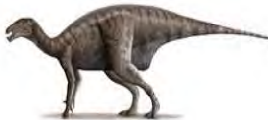
Fig 3. An iguanodon, illustration

“They have also found fossilized remnants of a creature they call iguanodon (Fig. 3), whose height was 15 feet and whose length was as much as 90 feet; from the character of its limbs, scientists have judged that it ate only grass. There is yet another species of animal called a megalosaurus (Fig. 4), which was only a little smaller than the iguanodon, but which was a hunter and carnivorous.