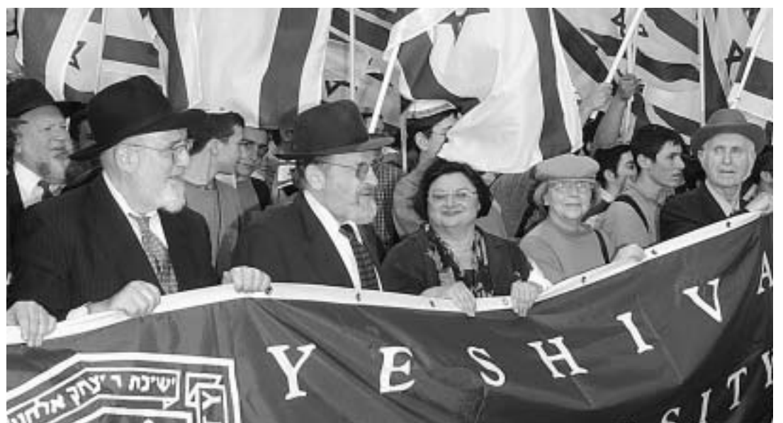
Faculty and administrators joined more than 1,000 YU students at the largest Israel Day Parade on record in NYC.

Also, many students have pledged at least 1% of their gross summer earnings to help support victims in Israel of Palestinian violence.