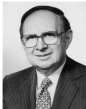
Dr. Henry Kaufman, famed economist and financial analyst

Dr. Kaufman's experience and reputation on Wall Street for accurate economic and financial analysis have made him one of the most sought-after consultants in the industry. He has served as chief economist of Salomon Brothers, and is president of Henry Kaufman & Company.