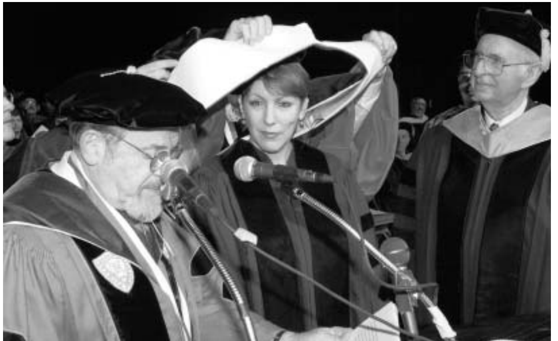
Israel Minister of Education Livnat is hooded at YU's 71st Annual Commencement Exercises.

Arthur Cohn, of Basel, Switzerland, is the only film producer in history to have won six Academy Awards. Included in his repertoire of recognized works are The Sky Above, The Mud Below; The Garden of the Finzi Continis; and One Day in September , a recounting of the tragic events of the 1972 Summer Olympics in Munich, Germany. Mr. Cohn has had retrospectives of his films presented at major film festivals around the globe