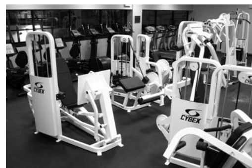
Wilf Campus fitness center features commercial-grade equipment.

Even with its two sushi chefs from Eden Wok and an extensive salad and soup bar, Le Bistro at 215 had its hands full at its recent grand opening. Students just couldn't eat