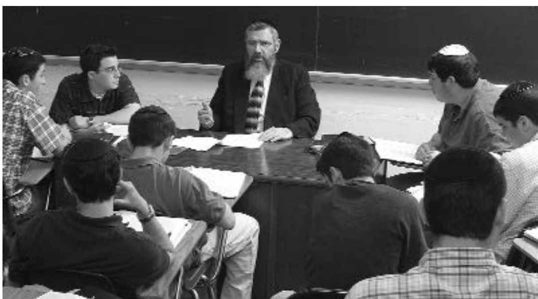
A class at HAFTR High School, where YU has established a kollel.

The HAFTR kollel and its global parent program are building blocks in the president's broad vision for the future, which embraces the