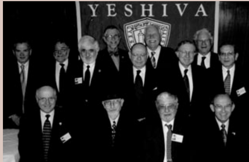
Members of the YC Class of '52 met for a reunion last May and were initiated into YU's Golden Shield Society.