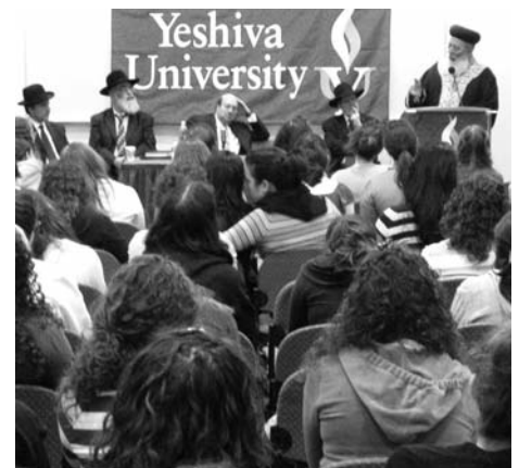
Chief Rabbi addressing students at Stern College for Women