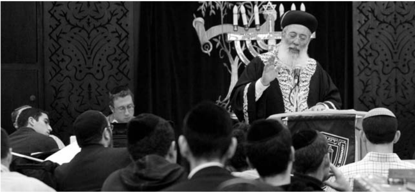
Chief Rabbi delivering a shiur in the main Bet Midrash to students and roshei yeshiva at Yeshiva University