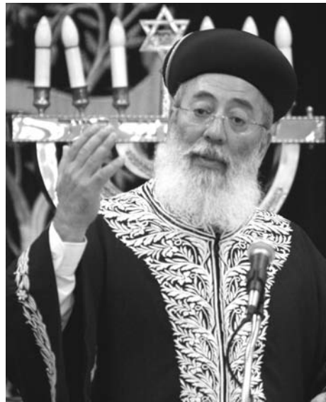
Chief Rabbi of Israel Shlomo Amar delivering a shiur in the main Bet Midrash at Yeshiva University

A highlight of the day's activities was a shiur that lasted over an hour in the main Beit Midrash, where the student body of RIETS and other YU students were in attendance. The topic of the shiur was Shemita (the agricultural laws of the